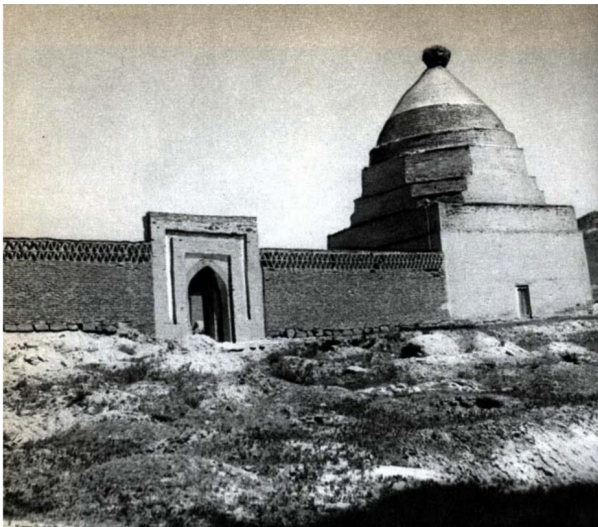
Figure 2. Shah Fazil mausoleum

of the building is 163-167 cm. The entrance dome room in the northern part of the complex is a later construction. On each opening on both sides of the mausoleum door, there is a panel with stucco moulding and slots of simple geometric patterns. The panel on the left at the entrance to the building is located rectangular. In the centre of the panel, there is a six-pointed star with a pattern created with the continuation of all the constituent lines. This leads to the differentiation of diamond-shaped, hexagonal and arrow-shaped sections. The only addition is two embedded lines in the centre of the main elements of the strap. The opposite panel has basically a curved pattern centred in a circle (McClary, 2020).