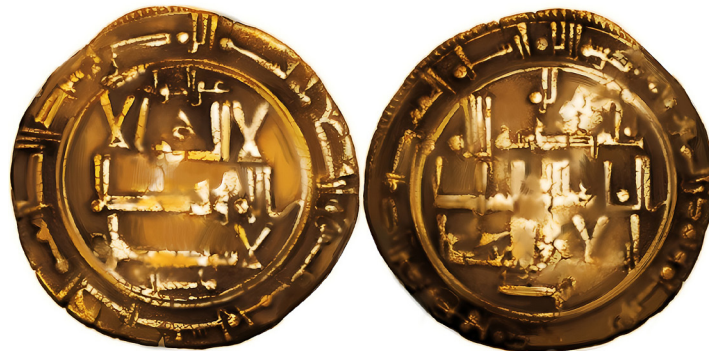
Figure 1. Coins of Muhammad ibn Nasr

The earliest capital buildings of the complex do not belong to the 7 th or 8 th centuries, but to the 11 th century. Based on this, the Shah Fazil complex belongs to the monuments of the epoch when most of Central Asia was under the rule of the first Turkic dynasty of the region, the Karakhanids. The most likely ruler who laid the mausoleum and was buried in it is a representative of the Karakhanid dynasty, Muhammad ibn Nasr, who ruled in part of the Karakhanid state between 1020 and 1056. The identity of Muhammad ibn Nasr is known, first of all, according to numismatics, very little is known about him (Soucek, 2000) (Fig. 1). The construction of the Shah Fazil complex, which began under Muhammad ibn Nasr, was completed during the reign of his son Malik, the former ruler of Ferghana (Biran, 2015; Kamoliddin, 2022).