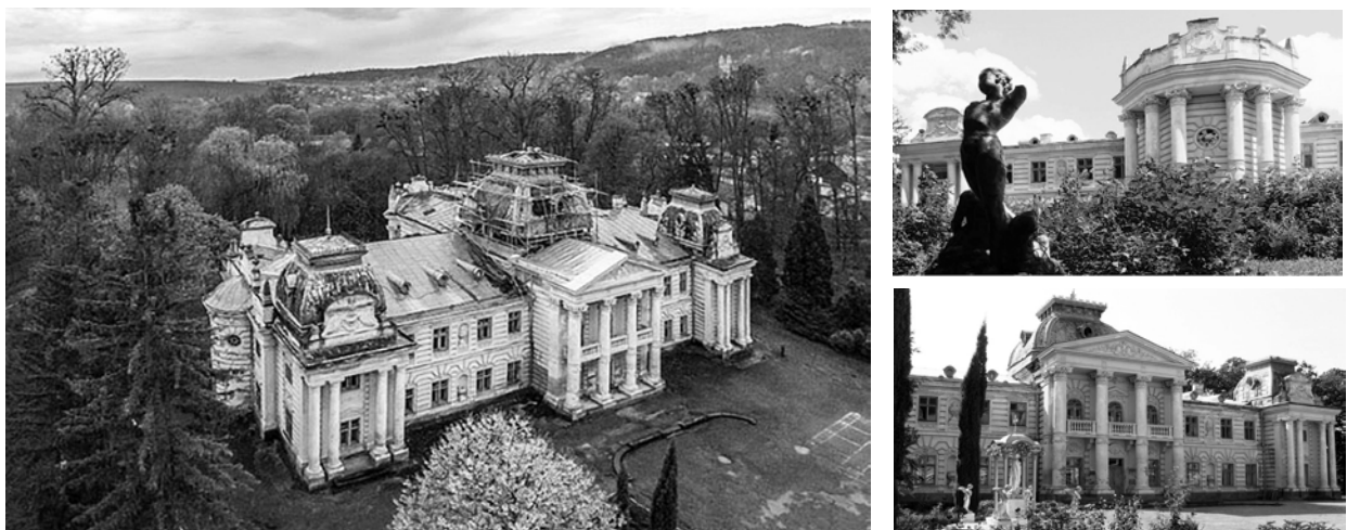
Fig. 3. The Koropets palace and the park complex – the Badeni palace and the remains of the nearby landscape park on the Dniester river, 2015 [1, 5]

The palace had two floors and was decorated with three risalits and a shaped roof. The most impressive was the artistic combination of colored wood for the flooring and panels on the walls. Till our times an oval ballroom with a black marble fireplace, the so-called royal room, was preserved. The room was decorated with the portraits of Polish Kings by Marcel Mashkovsky, which were the exact copies of the famous works of Jan Matejko. A dining room, library, and a chapel were placed next to the ballroom. The other side of the building served for housing purposes, as well as the first floor, which was more ordinary (Fig. 3) [2, p. 95–96].