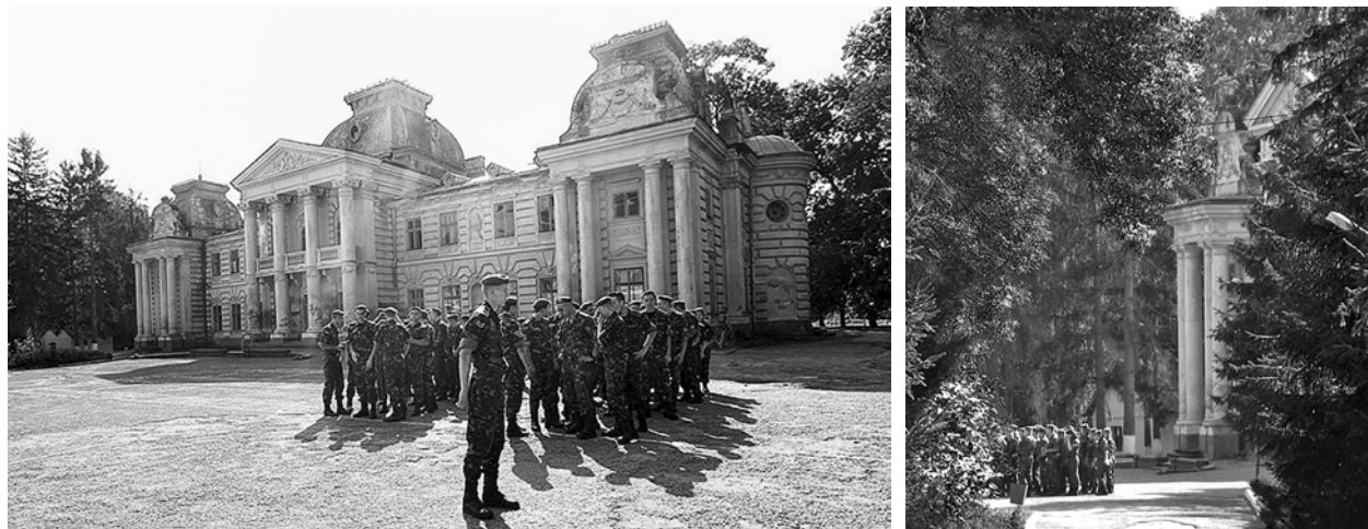
Fig. 5. A military boarding school, placed on the territory of the palace and the Badeni park complex in Koropets, 2014 [8]

Nowadays, the palace and the park around it are in a very poor condition. Despite the great concern among the local community and tourists, no investments have been made in its reconstruction.