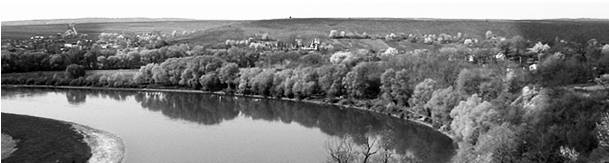
Fig. 1. Panorama of the natural park of the Dniester canyon [1]

The first written mention of Koropets dates back to the year 1421. In 1427 the town was granted Magdeburg rights. Despite numerous wars and disastrous Turkish and Tatar invasions, the town managed to preserve its original look.