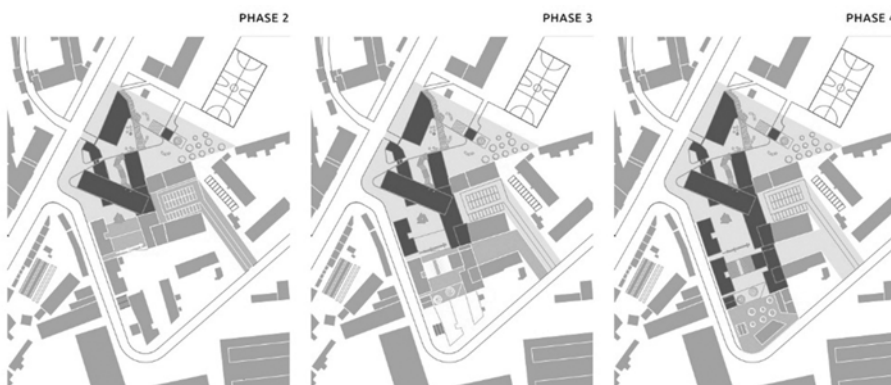
Fig. 3. The second stage of impulse development of the quarter with incorporation of metabolic qualities of further performative expansion to other areas in north-eastern outskirts of the city Lviv, (new street area, square, the local community center, children's and educational institutions)

On the second stage, the features incorporated in the first phases are growing and getting more complex, developing geographically to the quarter with the square of 3450.05 m 2 (Fig. 3). Thus a city formation is created, with its own area and community center further down the street. The planning and spatial structure of the formed territory is organized on the principle of evolutionary metabolism, that each cluster of the final quarter which contains unfinished items for a possible further expansion in space and transforming the entire space of the south-eastern outskirts of the city, which is composed of abandoned industrial enterprises and low quality buildings.