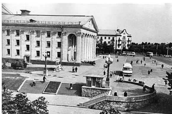
Fig. 6. Rivne. The Theatrical Square.

The complex nature of the planning and space-spatial structure preservation of the centre in Chernivtsi determined the main direction of its development in the first post-war decade (Fig. 7). The street network remained practically unchanged, and the building was supplemented by separate buildings – inserts. Their modest classical architectural forms were rather organically combined with eclectic and secessionist forms that prevailed in the construction of Chernivtsi centre [9].