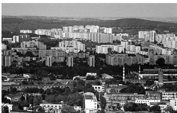
Fig. 8. Lviv. New residential district North , 1970s–1980s.

In large cities, two diverse city images were developed: 1) the image of the historic city centre with architectural monuments; 2) the image of new industrial and massive multi-storey residential developments. Industrial nodes and new residential areas have become self-sufficient elements of urban space with their own “industrial” architectural image, due to the wide use of large-panel structures. The designs of new residential areas in Lviv, Lutsk, Ivano-Frankivsk, Rivne, Ternopil, Uzhhorod, and Drohobych are good illustrations of the idea.