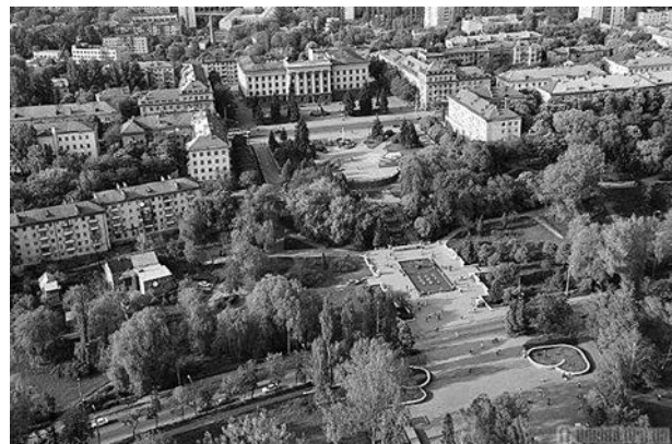
Fig. 5. Lutsk. Central square, 1955.

A post-war formation of a new city center in Lutsk took place somewhat differently. It was decided to transfer the new city centre to a new territory near the historical centre, which did not undergo significant military destruction. The first post-war general plan of Lutsk provided for the formation of a new urban centre system in the form of two squares, connected by a new main street on the shore terrace of Styr.