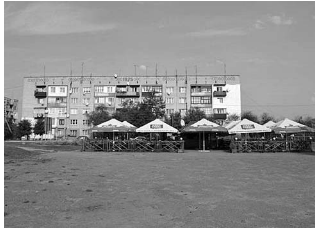
Fig. 11. Rava-Ruska. New building in historic city centre, 1980.

The situation changed in the early 1980s under the influence of the critique of functionalism and the transition to postmodernist conceptions of the architectural and urban-type forms of creation. A wide variety of stylized architectural forms were widely distributed, designed to “decorate” and “regionalize” the building image. Similar decisions have gained much of popularity in the construction of the resort towns such as Truskavets, Morshyn, and Yaremche. The spatial forms of postmodern architecture of various design found their application in numerous buildings constructed on the site of amortized building. In this respect, the characteristic features have the centres of Drohobych, Ivano-Frankivsk, Lviv, and Zhovkva, where new buildings are organically fitted into the historical context.