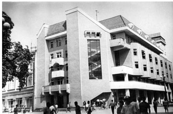
Fig. 7. Ivano-Frankivsk. New office and apartment buildings, 1985.

In large cities, two diverse city images were developed: 1) the image of the historic city centre with architectural monuments; 2) the image of new industrial and massive multi-storey residential developments. Industrial nodes and new residential areas have become self-sufficient elements of urban space with their own “industrial” architectural image, due to the wide use of large-panel structures. The designs of new residential areas in Lviv, Lutsk, Ivano-Frankivsk, Rivne, Ternopil, Uzhhorod, and Drohobych are good illustrations of the idea.