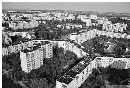
Fig. 9. Lutsk. New residential district 1970s–1980s.

The city ensemble of Lviv centre was enriched with the quarter of new buildings of Lviv Polytechnic (built from 1965 to 1978); the centre city of Ivano-Frankivsk was supplemented by the buildings of the main post office and the theater; Lutsk, Rivne, Ternopil, Uzhgorod received new hotels and department stores with the common design. In the mid-1970s, it became clear that the abstracted, “tied” from the “place” and the cultural context, “typical” architecture proved to be unable to form a complete spatial environment. In this situation, it was logical to apply architectural traditions, especially in those cities where the rich architectural heritage has been preserved. During the period of 1975-1986, state architectural preserves were organized in Lviv, Kamyanets-Podilskyi, Lutsk and Dubno, which included the territory of historical centres.