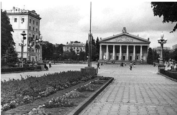
Fig. 4. Ternopil. Central Square with the theatre, 1955.

At the same time, in most of the cities centres of Western Ukraine, there was no broad potential for the creation of new ensembles, as they retained a rich historical and architectural heritage in one form or another. Forming the spatial structure of city centres, the monuments of urban planning and architecture significantly restricted the possibility of creating new ensembles. Accordingly, the requirements for a new image creation of the cities centres in an expanded form could only be carried out in those cities where the existing urban situation allowed for radical spatial transformations. Favourable preconditions for this were formed in Ternopil, Lutsk, and Rivne in 1945. Ternopil is a typical example, where an architectural-landscape system was formed in the city center during the post-war reconstruction of 1945-1955. It is marked by the unity and harmony of natural and architectural forms, is organized in space in accordance with the unified artistic conception that creates a rich and interesting architectural image. The reconstruction of Ternopil centre began on the basis of the general plan scheme of 1945, and then continued in accordance with the general plan of 1954, which provided the formation of new ensembles in the destroyed territory of the city centre. The basis of the space organization concept for both plans was the idea of creating a system of greened areas, squares and boulevards in the center of Ternopil in 1945–1955 (Fig. 4) [5].