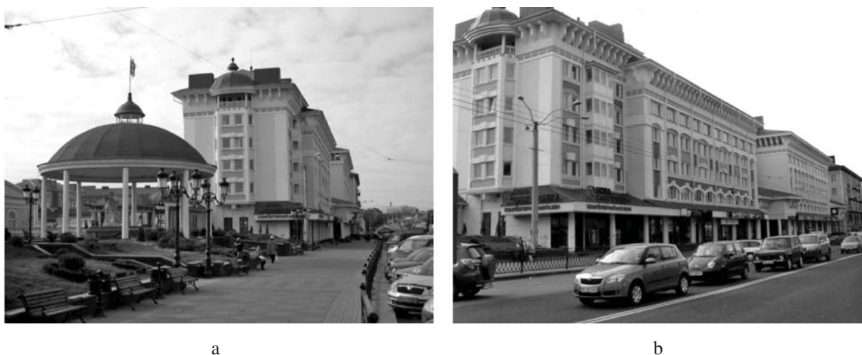
Fig. 14. Rivne. New complex with a rotunda (a); Rivne. Street view. Source (b): photo by B. Posatskyy, 2008

Against the background of chaotic changes in the appearance of cities in Western Ukraine at the beginning of the 21 st century, the city of Rivne has gained certain exceptions in that respect. Its purposeful development of architectural image has followed its master plan of 2003. It defines a landscape framework development of Rivne along the Ustya River (north-south direction) and the urbanist framework to the east-west direction. The street of Soborna was formed as the result of the city-building concept of a new public complex along the main highway in the western part of the city [16].