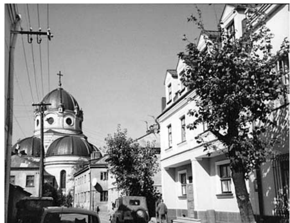
Fig. 13. Zhovkva. City centre, 1995.