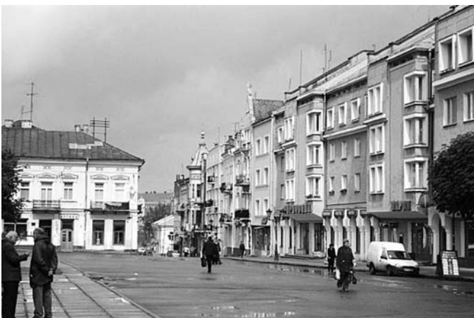
Fig. 12. Drohobych. Market Square, 1985.

Describing the period of the 1980s, the inspiring influence of the cultural regional heritage on the process of composite formation of spatial forms and architectural details has been immense. In the cities of Western Ukraine, the process of construction “sealing” often contributed to the restoration of the planning structure and spatial form of previously lost traditional urban neighborhoods (Fig. 12, 13). Extensive searches for regional forms based on local traditions of the 1980s gradually changed into “new eclecticism” of the 1990s due to the effects of commercial mass culture. Radical socio-political and economic changes which took place in Ukraine in 1991 significantly changed the conditions of urban development activities. Forms of ownership changed, and the abolition of lots of Soviet-era constraints led to a huge “explosion” of residential housing in cities. Unfortunately, the architectural image of the cities in western Ukrainian regions generally suffered heavy losses.