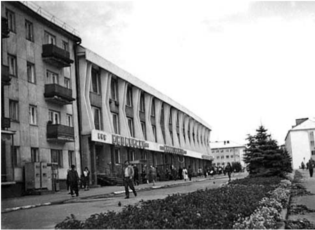
Fig. 10. Brody. New buildings in historic city centre, 1980.