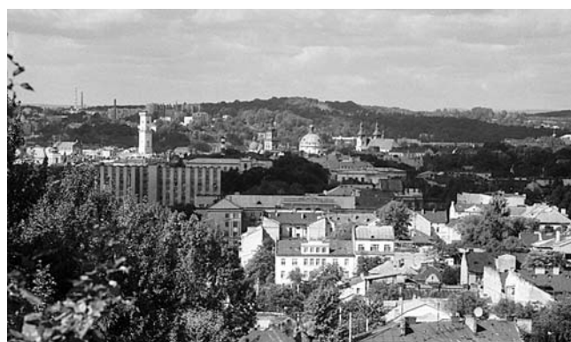
Fig. 7. Lviv. The general view of the city centre. Source: photo by B. Posatskyy, 1995

A similar city-building situation has developed in the centre of Uzhhorod. The city was not ruined, its core – a spatial structure of the centre remained in the complex, only some elements of needed renovation. Small architectural forms were set up in small streets and squares, decorative herbalsists and flower beds were formed.