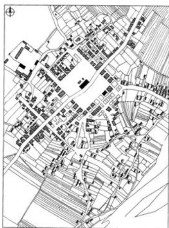
Fig. 1. Skole. Cadastral plan, 1853 [3]

Over the centuries of development of western Ukrainian cities, the diversity of forms of their urban structures (the territory's expansion) has survived to this day. The most characteristic are: – centered plans based on regular plans of medieval cities, for example: Berezhany, Brody, Busk, Buchach, Gorodok, Drohobych, Zhovkva, Zbarazh, Zolochiv, Kolomyia, Lviv, Mykolayiv, Ostroh, Radekhiv, Rohatyn, Sambir, Skole, Ternopil, Truskavets, Uzhhorod, Chernivtsi, Yavoriv (Fig. 1); – linear plans based on the factors of the surrounding landscape, such as: Dubno, Kremenets, Pustomyty, Rakhiv, Skala Podilska, Sokal, Straryi Sambir, Voda Vyshnya, Tyachiv, Yaremcha (Fig. 2); – irregular (combined) plans are developed on the basis of plans that evolved from both of these types and are typical for medium or large cities occupying vast territories, for example: Ivano-Frankivsk, Lutsk, and Rivne (Fig. 3). While preserving the area of historical centres, which continue to be the centres of the city plan, the town-planning structures of these cities over time have changed significantly and have increased geographically.