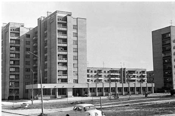
Fig. 6. Lviv. New apartment buildings, 1970.