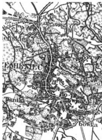
Fig. 2. Kremenets. Town plan, 1853