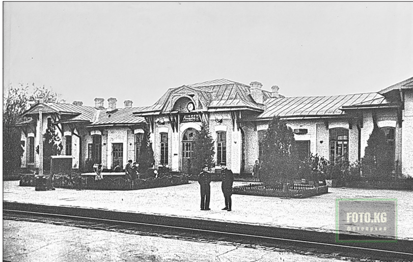
Figure 2. Pishpek station