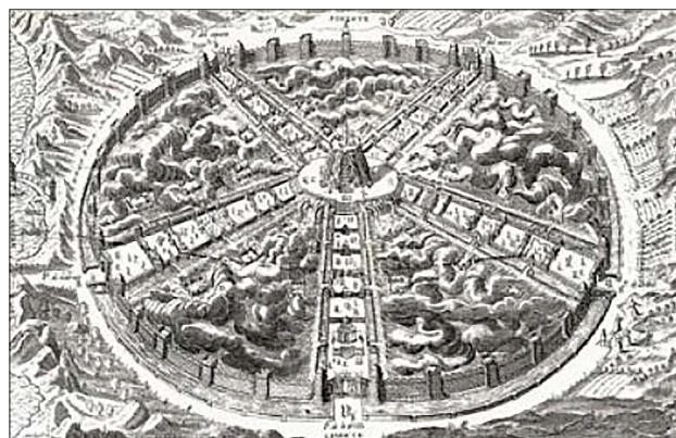
Figure 4. The City of the Sun, 1920

During the 1920s and 1930s, significant industrial enterprises were established in Frunze, laying the foundation for the modern western industrial zone. One notable example of urban planning from this period is the "Workers Township", a project realised by Czechoslovakian communist workers who had founded the "Interhelpo" cooperative in Frunze. The name "Interhelpo" translates from Ido (Esperanto) as "mutual aid". This cooperative, operating in the city from 1923 to 1943, was involved in constructing power stations and foundries, becoming the progenitor of Kyrgyz industry and a leading force in the republic's industrialisation during the pre-war period (Alymbaev, 2024). The "Workers Township" project embodied the dream of realising the utopia envisioned by the Italian Renaissance scholar Tommaso Campanella in his work "City of the Sun" (Figs. 4, 5).