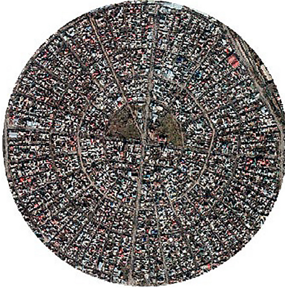
Figure 5. Bishkek. Workers Township, 2024