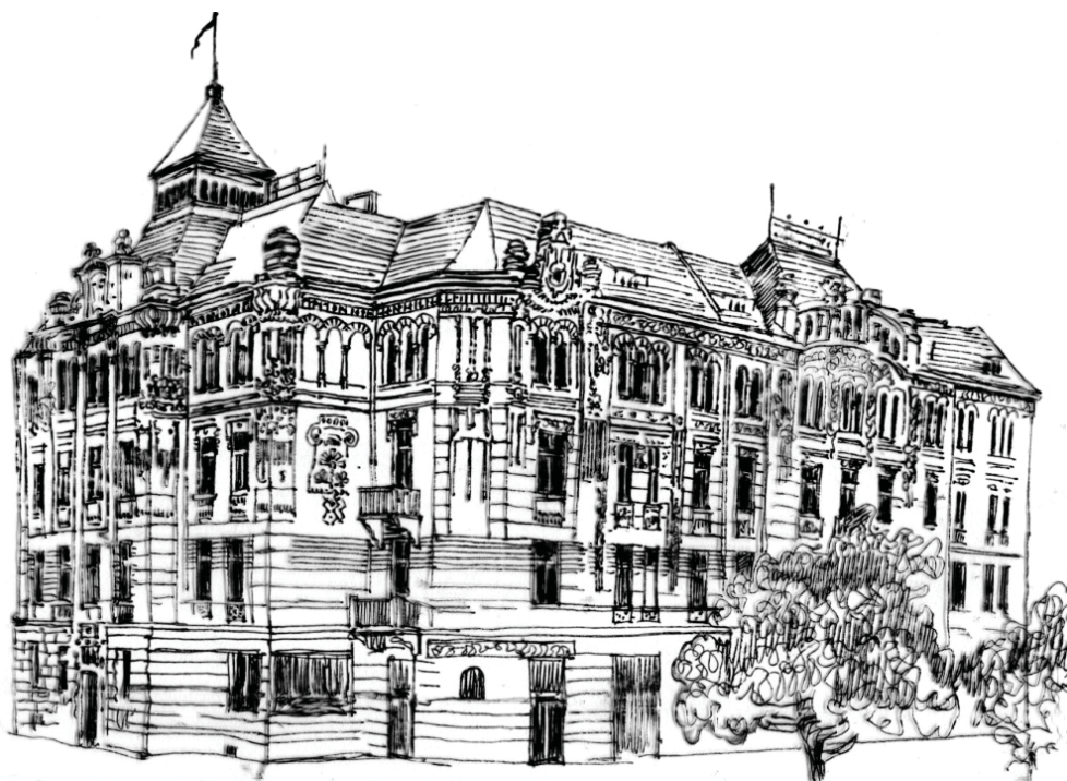
Fig. 3. The building of Dnister Credit Company (author's own drawing)