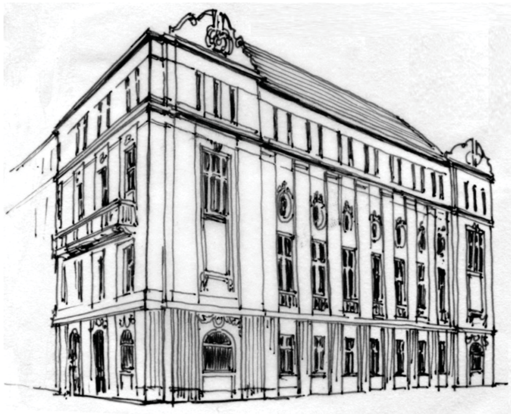
Fig. 5. The building of Lysenko Music Society (author's own drawing)

The analysis of a broad spectrum of architectural methods and tools used in formation of the Ukrainian architectural identity within the framework of the Ukrainian Art Nouveau style in the whole Ukrainian territory (Chepelyk, 2001) gives a possibility to divide them into several groups: 1) reproduction of shapes of famous buildings of the ancient Ukrainian architecture, typically the wooden one, in new and more durable materials; 2) use of shapes of the Ukrainian (Cossack) Baroque, since this period is associated with the revival of the Ukrainian statehood and Ukrainian traditions in the art and architecture; 3) use of form-shaping principles traditional for the Ukrainian folk architecture: borrowing the forms of roofs and cupolas from the folk wooden architecture, including the sacral one; introduction of the color contrast of light walls with dark high roofs; 4) use of ornamental motifs of the Ukrainian folk art as an architectural decoration of facades of Secession-style buildings; 5) use of Ukrainian motifs only in the decoration of interiors.