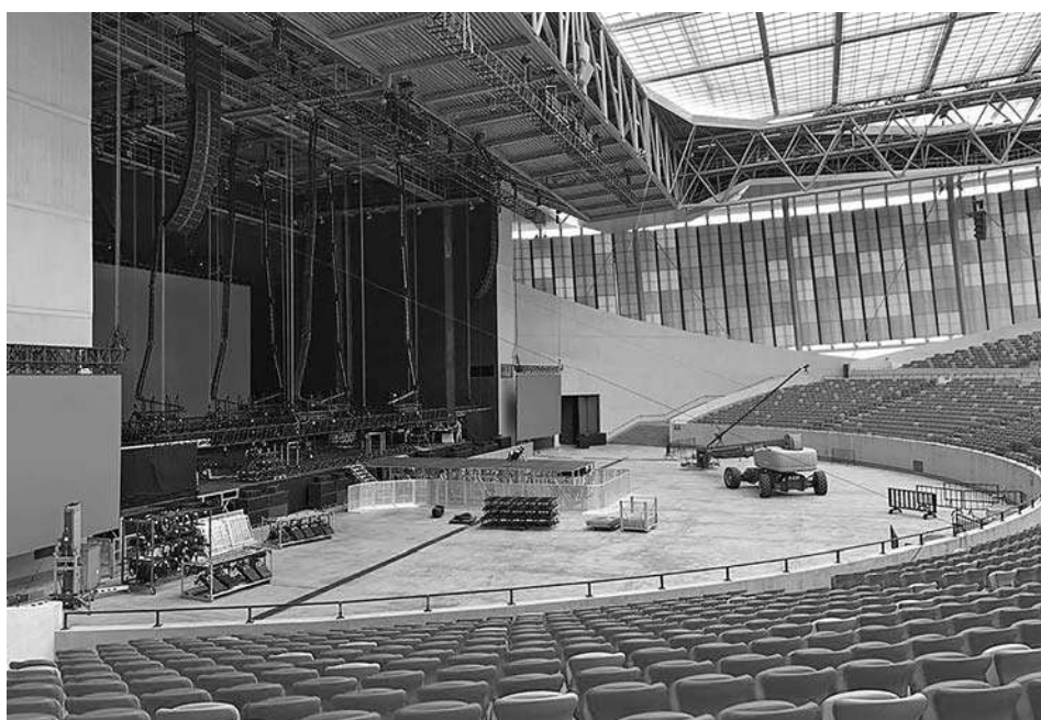
Fig. 3. Stage and amphitheatre space. Black Sea Arena in Shekvetili.