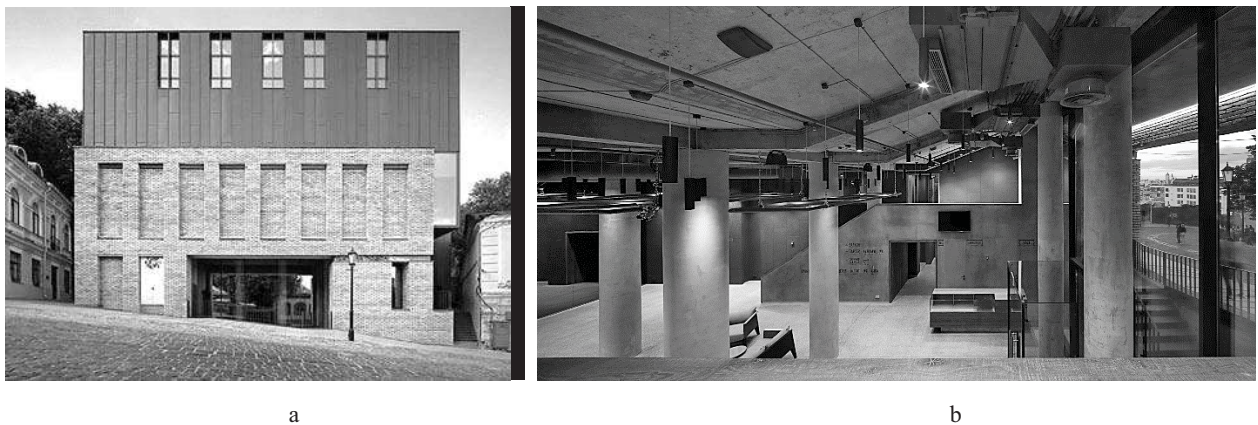
Fig. 1. The main facade of the Podil Theater in Kyiv (a); the lobby interior (b) [I]

By the method of organizing the light environment by the first group of theatrical buildings is the Podil Theater in Kyiv (2016, reconstruction). The lighting design of the theater offers minimal interference with natural light into the interior space (see Fig. 1a). Natural light penetrates only those areas where it is needed for utilitarian purposes, or to open the interior space outside. The general nature of lighting is formed using natural and electric lighting (see Fig. 1b). General lighting is dominated by electric lighting, which creates unusual lighting effects. For example, a dark ceiling and walls and a brightly lit floor create a theatrical character of interior lighting in the lobby of the theater.