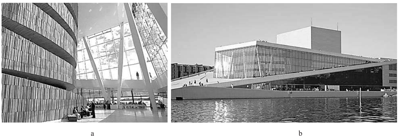
Fig. 2. Oslo Opera House interior (a); general view of the theater from the sea (b) [II]

The Walt Disney Concert Hall (Los Angeles, 2003) consists of separate blocks whose facades are made of curved metal sheets. At first glance, the facades of the building completely shield the interior space from sunlight. However, this is not the case. Daylight penetrates the interior space through the exterior glass areas that frame nearly the entire perimeter of the ground floor building, same time, through vertical windows hidden in the configuration of curvilinear wall panels. According to the architect (Frank Gehry), the erratic bends of the steel facade surfaces designed to capture sunlight. Through high windows and glazed areas, daylight enters not only the lobby but also the auditorium.