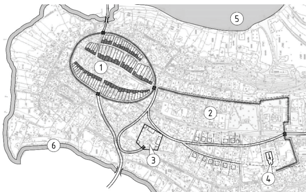
Fig. 4. The coexistence of the Old City in Sharhorod (Kniazha Luka settlement) and the New City (built by Jan Zamoyskyi and his son Tomasz): 1 – Old City with market square, 16th century; 2 – New City, first part of the 17th century; 3 – Zamojski Castle, 4 – St. Florian's Church 5 – city pond; 6 – Murafa river (developed by I. Litvinchuk)