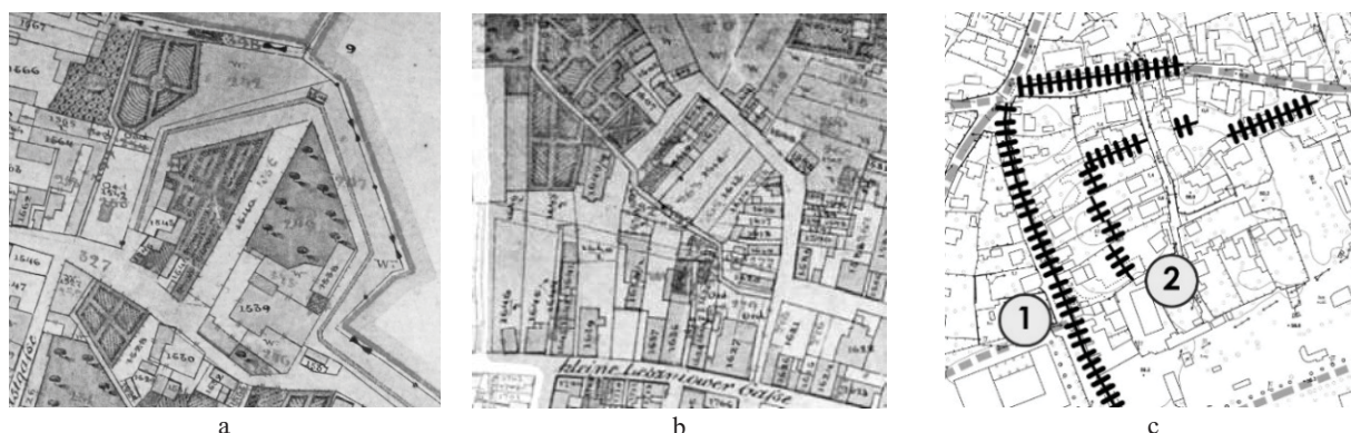
Fig. 2. Preserved bastion with a park in Brody, middle 19th century (a), Partition of a demolished bastion for further construction works (Gesher Galicia, 1844) (b), Identified partition of the city fortifications in Yampil (c)

At the end of the 18th century, the defensive structures of the city were transformed into a village area. It is mainly connected with a shift in a military doctrine – battles moved to the field location, and to win a fortress of the city meant little for the fighters. In this regard, it was not reasonable to spend a lot of funding to maintain urban fortifications. The territory of the defensive city structures was rented out to arrange public spaces – boulevards, avenues, or for the construction works, or to give to the religious organizations into possession. The comparative analysis of cadastral maps of Brody and Bogorodchany of the middle of the 19th century proves that the residential parcels of land are connected with the shafts and moats on one side, generally in a perpendicular way to their rectangular section. The streets are thus formed along the earth shaft and/or outer edge of the moat. It allows us to consider both the street network and the subdivision of neighborhoods to identify defense relics in cities.