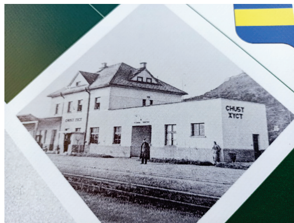
Figure 4. Khust railway station building Notes: photograph of 1920-1930 from the exhibition stand of the Lviv Museum of the History of Religion