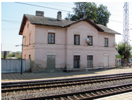
Figure 1. A typical station building of the Hungarian State Railways (MÁV) from the late 19 th and early 20 th centuries in Batiovo Source: photographed by Youri Rotchniak (2015)

The architecture of railway stations in Zakarpattia deserves special attention. It is a spatial and constructional embodiment of the perceptions and capabilities of society in different historical periods and, at the same time, continues to exist and serve the modern community. Railway stations and their buildings form a wide palette of types, sizes, styles, and compositional techniques. They are unique to Ukraine and need to be studied, preserved, and developed (Rotchniak, 2021) (Figs. 1-6).