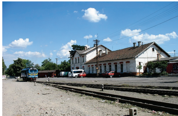
Figure 3. Platform of narrow-gauge trains at the Vynohradiv station in the late 19 th and early 20 th centuries