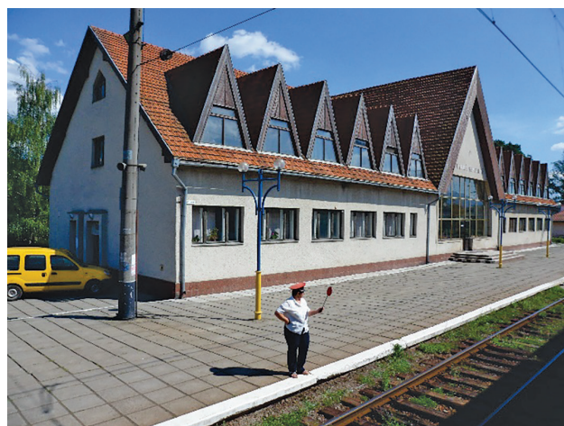
Figure 5. Building of the Velykyi Bereznyi station in the late 20 th century