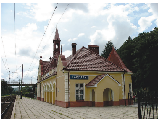
Figure 2. The building of the Karpaty railway station (also the eponymous modern sanatorium) of the former palace complex of the Schönborn Counts in the late 19 th century near Chynadiievo