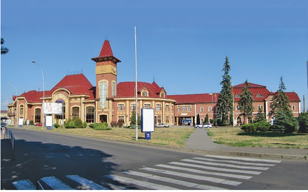
Figure 6. Complex of the new (left, 2004) and historic buildings (right, 1905) of the Uzhhorod railway station

Geographical and spatial features of railway connections in Zakarpattia. The territory of Zakarpattia occupies the flat steppe part of the Middle Danube Lowland along the Tysa river basin – in fact, ‘beyond the Carpathians’ (‘trans the Carpathians’) in relation to Kyiv and most of the country, and in contrast to ‘Prykarpattia’ (by the Carpathians) – the southwestern foothill part of Galicia and Bukovyna. Zakarpattia is also the mountainous area to the south and southwest of the Main Carpathian watershed of the Tysa river basin. Overall, based on the topography, the main railway lines of Zakarpattia can be divided into plain and mountain lines.