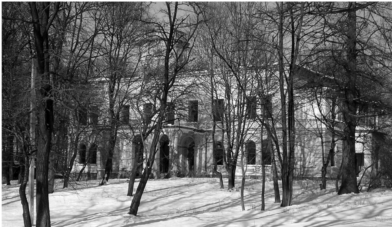
Fig. 2. The palace after the fire, without a roof. Phot. by Roman Wójcicki, 2013