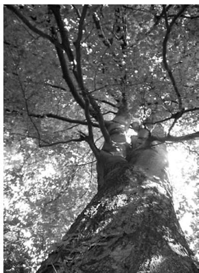
Fig. 3. A beech tree in the park.