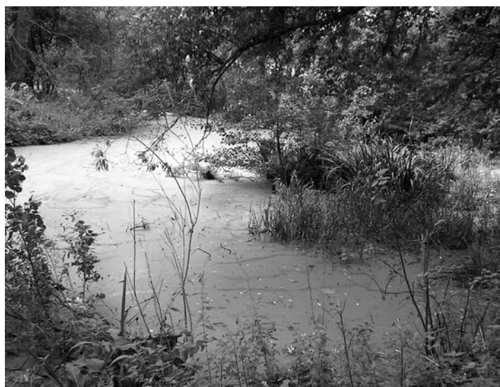
Fig. 4. The pond. Photo by Roman Wójcicki, 2015