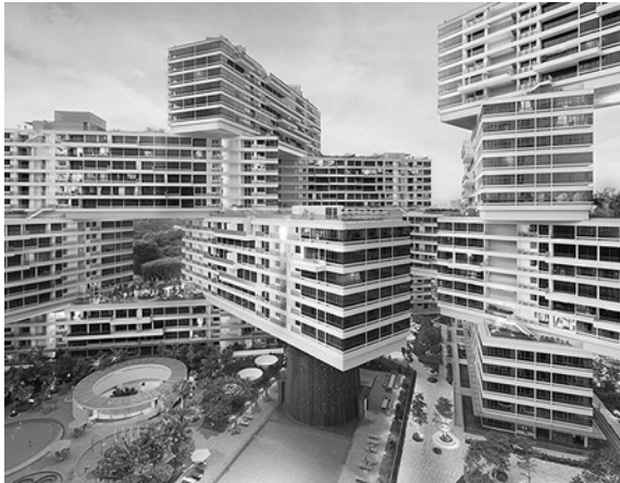
Fig. 3. Interlace Quarter in Singapore [21]