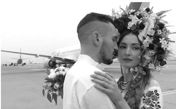
Fig. 1. Marriage at Boryspil Airport, Kyiv [38]

It is worth concentrating on the main motivating basis of this type of urban structure, which is easy access to a large selection of life opportunities. In that case, both components of this dichotomy are inversely proportional, which means that the easier accessibility tends to as much choice as possible, and the biggest choice wants to be easiest to access. In this context, the new urbanistic reality forms itself, the process of which does not depend on the environment in which it occurs. In other words, the potential of dichotomy (accessibility-choice) is capable of transforming any already existing urban objectivity, which has developed in previous historical periods as a result of different conditions. The main instrument here is the market response mechanisms for the proposal, which increasingly acquires the structure of the “wide choice” and pushes transforming of the surrounding areas towards the relevant to it (“wide choice”) principle of mixed use [14].