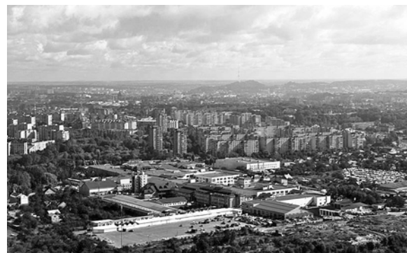
Fig. 2. Market “Pivdennyi”, Lviv [29]

The contrast between the two methodological tendencies can be illustrated by the facts that the society uses some objects with purposes which are not related to the actual functions of the past economic formations, but were erected recently and in accordance with the actual needs of the city. An example of this development could be the use of the Boryspil airport in Kyiv as a hall for wedding ceremonies, which began in 2017 [38] in a