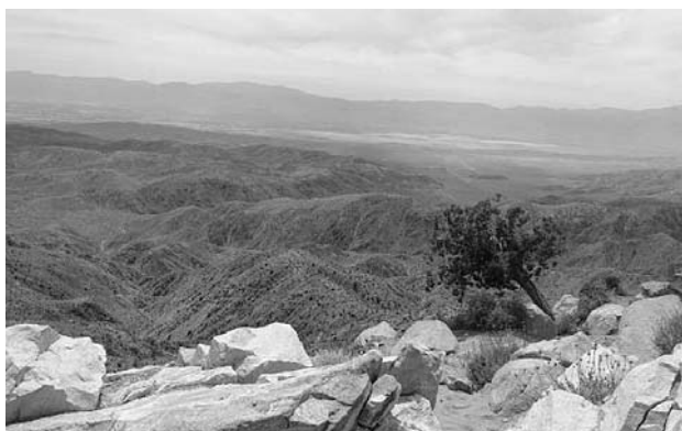
Fig. 1a. The illustration shows a foreground with a further panorama, The Joshua Tree National Park, United States.

species in turn of the removal of high green trees. In most cases it was a fixed amount of money to be put into a municipality account, or a person had to plant a sufficient number of new trees. Cutting down one or several trees has usually resulted in need to plant dozen or so or several dozen of trees. Depending on the species, size of the trunk and the age of a tree, amount of money paid to a municipality could reach even several hundred thousand and even millions of Polish zlotys. There were also situations in which no agreement was reached in cutting trees. (USTAWA, 2004)