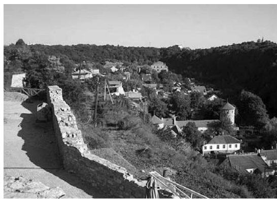
Fig. 1b. The illustration shows foreground with a further panorama, Ukraine.

One part of the study covers the selected area (Fig. 2, 3), and it is conducted on the basis of extensive field analysis. It was elaborated over several years and is related to the selected real estate and legal conditions. The basis was the study of the places where the landscape was altered by thoughtless but agreed by the law clearance of trees. The aim of cutting down the high greening was primarily to receive profit, and not the issues of threat to the environment or care for space. This kind of trees clearance would be acceptable in case it concerns safety of people or introduction of any kind of public space, however it was not the case.