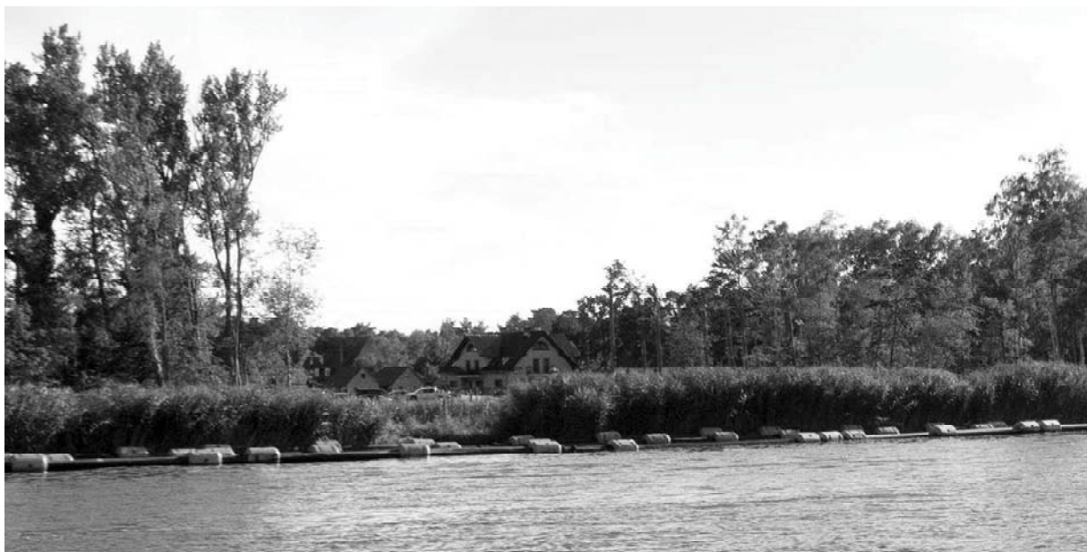
Fig. 4. The studied area in which the trees were cut down.

The adopted law allows to cut down the trees on a private property, and has led to its thoughtless increase as people do not check whether the area has a local plan of spatial development, which prohibits the removal of trees or is protected by Natura 2000 . It should be developed in the inspection of land use conditions and directions of municipality.