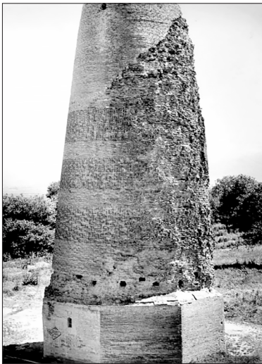
Figure 2. View of the minaret before the reconstruction (1927)

The architecture of minarets is going through a period of creative research, where the main endeavour is to reconsider the form, image and urban planning significance of these structures. The location of the minaret in urban space is becoming increasingly important as the symbolic significance of minarets in modern architecture increases, taking precedence over their original function of proclaiming the azan (Kerimkhulle et al. , 2023). There is also disagreement among architects about the loss of relevance and unnecessary of minarets in modern mosques. The study of Central Asian minaret building traditions becomes particularly relevant both in architectural practice and in cultural aspects. A deep understanding of the historical roots and evolution of these structures becomes a necessity for contemporary practitioners. Therefore, the architecture of the Buran Minaret, as the oldest object of Islamic architecture, acquires special significance for both theoretical analysis and practical application in modern minaret construction (Fig. 2).