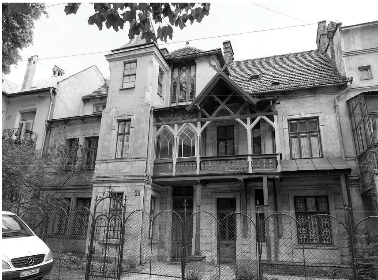
Fig. 3. The facade of the house on 29, Kotlyarevsky St.

Much richer range of such associations is caused by the architecture of buildings on 20 Nechuy-Levytsky St and 4, Kotlyarevsky St. Rapid, semi-palm roofs with large overhangs, covered with tiles, complete with wrought-iron spires and cut through by vertical chimneys create dynamic, picturesque silhouettes of structures, the outlines of which resemble Carpathian houses. The similarity of samples of folk housing is enhanced by the extensive use of wooden structural elements of the visor, bows, loggias on the rear facade, which are ambiguously associated with the open galleries of Hutsul and Lemkiv houses. For the first time in the architecture of these mansions, majolica inserts were used, decorated with peculiar brick frames. However, their colouristic solution (in particular, the introduction of blue and orange colours) and the nature of graphics (fluid, curved plant ornaments) do not fully correspond to the “Hutsul standard” developed at the end of the century. Polychromy facades enrich fragments of open brickwork on the corners of buildings and lintels of windows. The facades of houses along the street are a little similar in style characteristics on 33, 27 (former facade) and 29, Kotlyarevsky St. (Fig. 3).