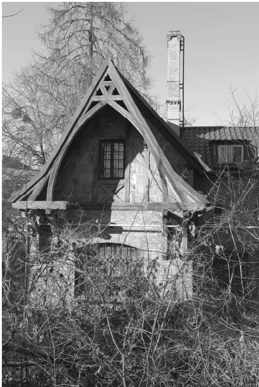
Fig. 4. The facade of the house on 14a Metrologichna St. – villa “Julietka”

In the architecture of the building we find Gothic motifs: gable pediment of the main facade, lancet windows, decorative buttress, interesting wooden structure of the canopy (stylistically, the structure reminds another well-known work of Yuri Zakhariyevych – the mansion-studio of the artist Ya. Styka on 11, Lystopadovyi Chyn St., which was designed and built at the same time). The most surprising thing is that Yu. Zakhariyevych still managed to create a “national” image of the building, without resorting to direct quoting specific motives and forms, using a building material that is not typical for Ukrainian folk architecture: solid open brickwork. The only “informative examples” that specify the “nationality” of the structure are ceramic inserts.