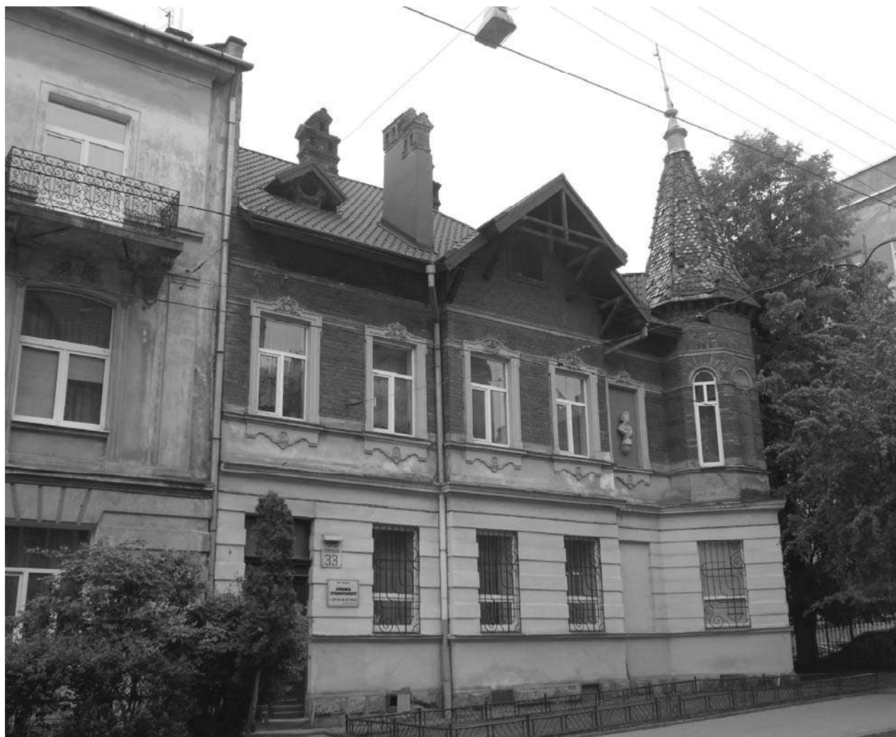
Fig. 5. The facade of the house on 33 Chuprynka St.

carved windmills, balcony posts, balcony railings (Fig. 5). Even more eclectic is the decoration of the facade of the mansion on 61 Chuprynka St, which is mainly based on forms of German neo-renaissance. So, the last decade of the XIX century was a time of the empirical search for national identity in architecture, which was accompanied by the appearance of such dissimilar buildings.