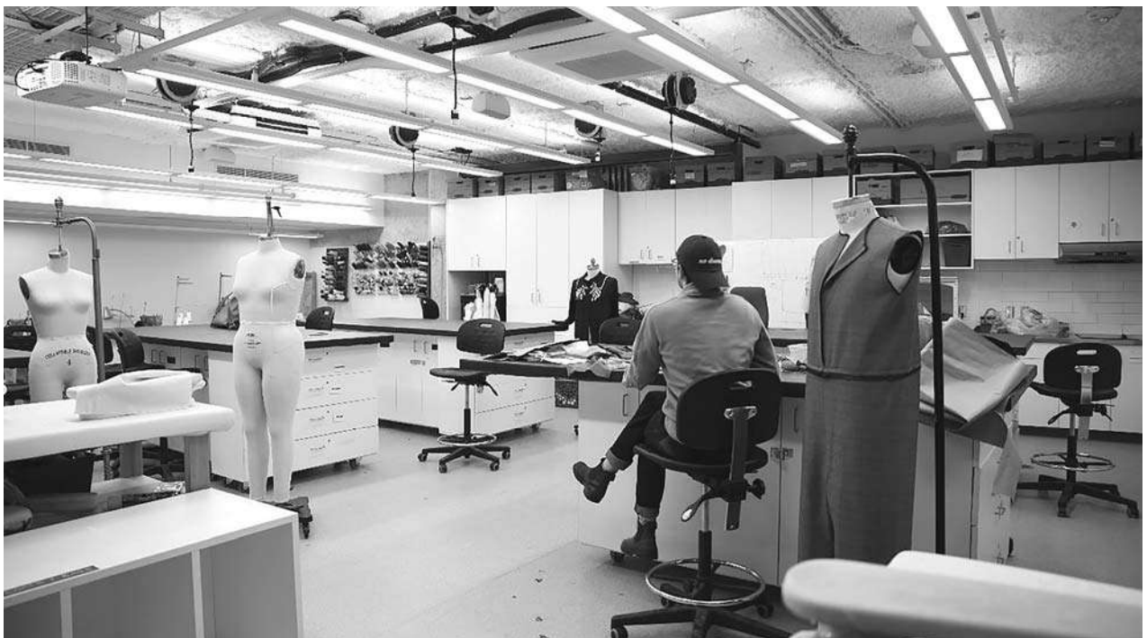
Fig. 5. Costume Shop.