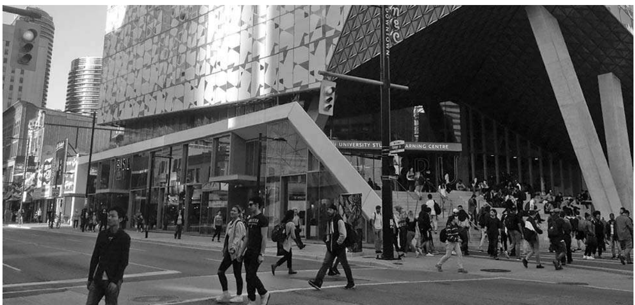
Fig. 1. Student Learning Centre on Yonge Street, Toronto.

Such construction of the theater studio allows creating various scenographic solutions for performances: employing light, light-shadow, kinetic projections, as well as by traditional means, using costume design, scenographic painting, and color of curtains, stages, pallets, etc.