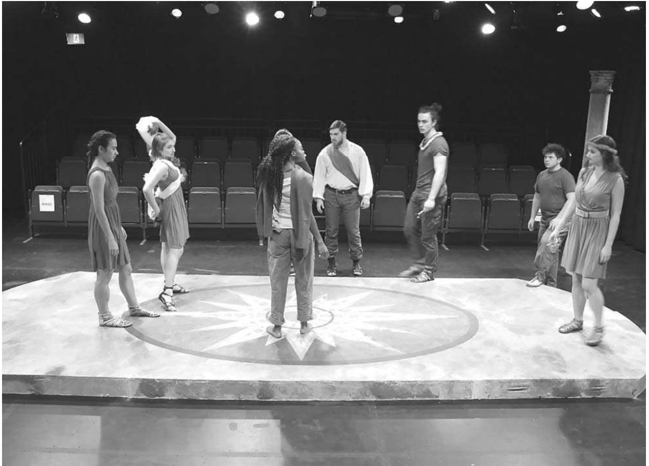
Fig. 12. Various performances and rehearsals in the new flexible Studio Theatre.