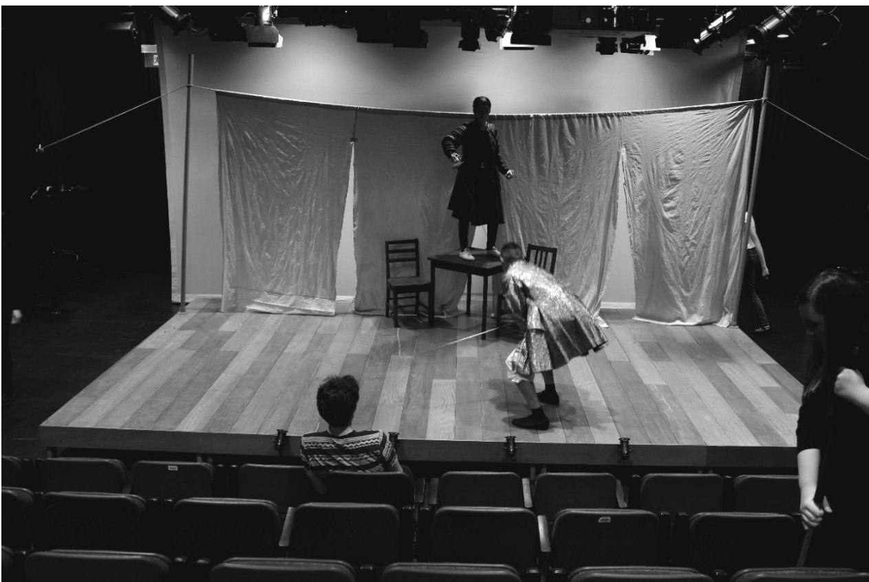
Fig. 11. Various performances and rehearsals in the new flexible Studio Theatre.