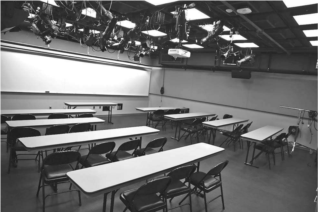
Fig. 6. Sound Lab.