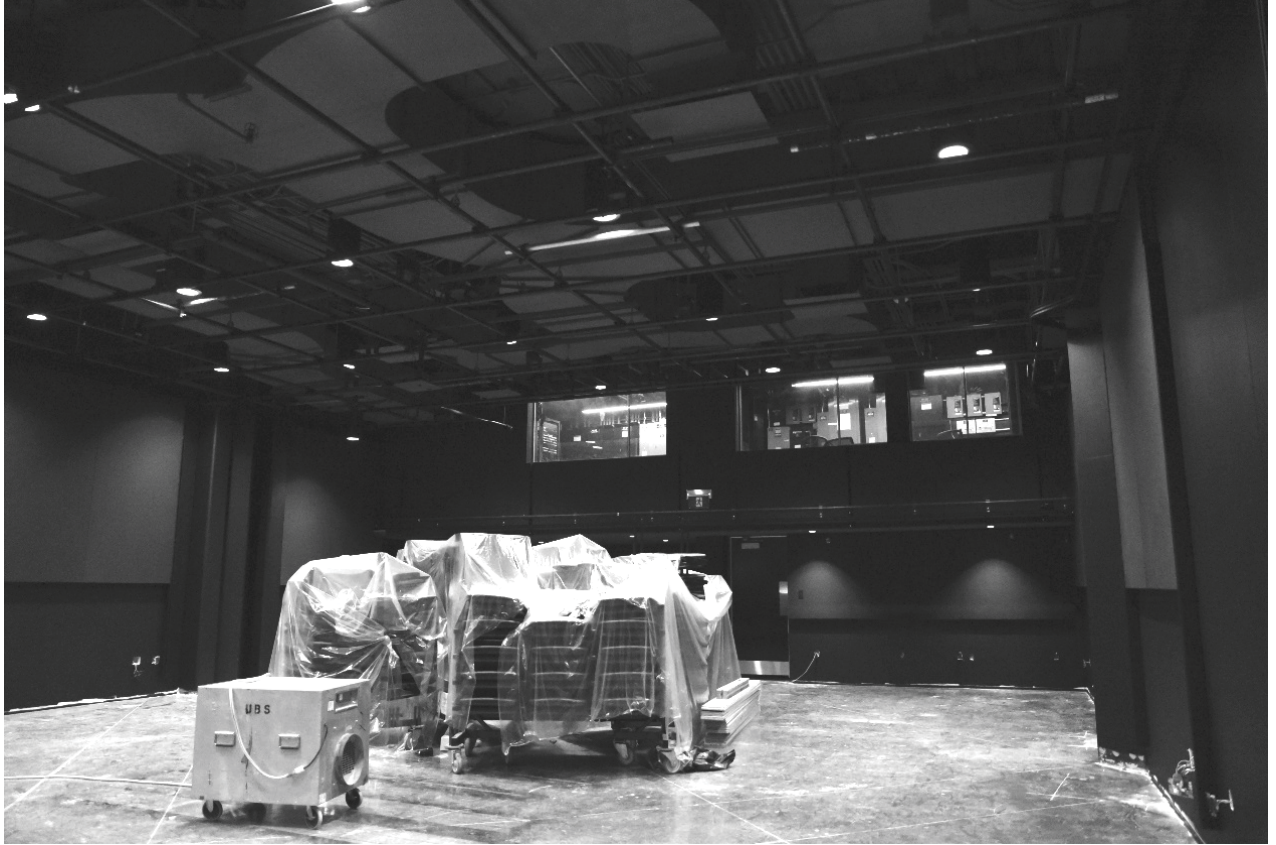
Fig. 8. Studio Theatre.