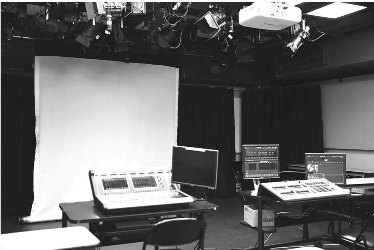
Fig. 7. Lighting Lab.