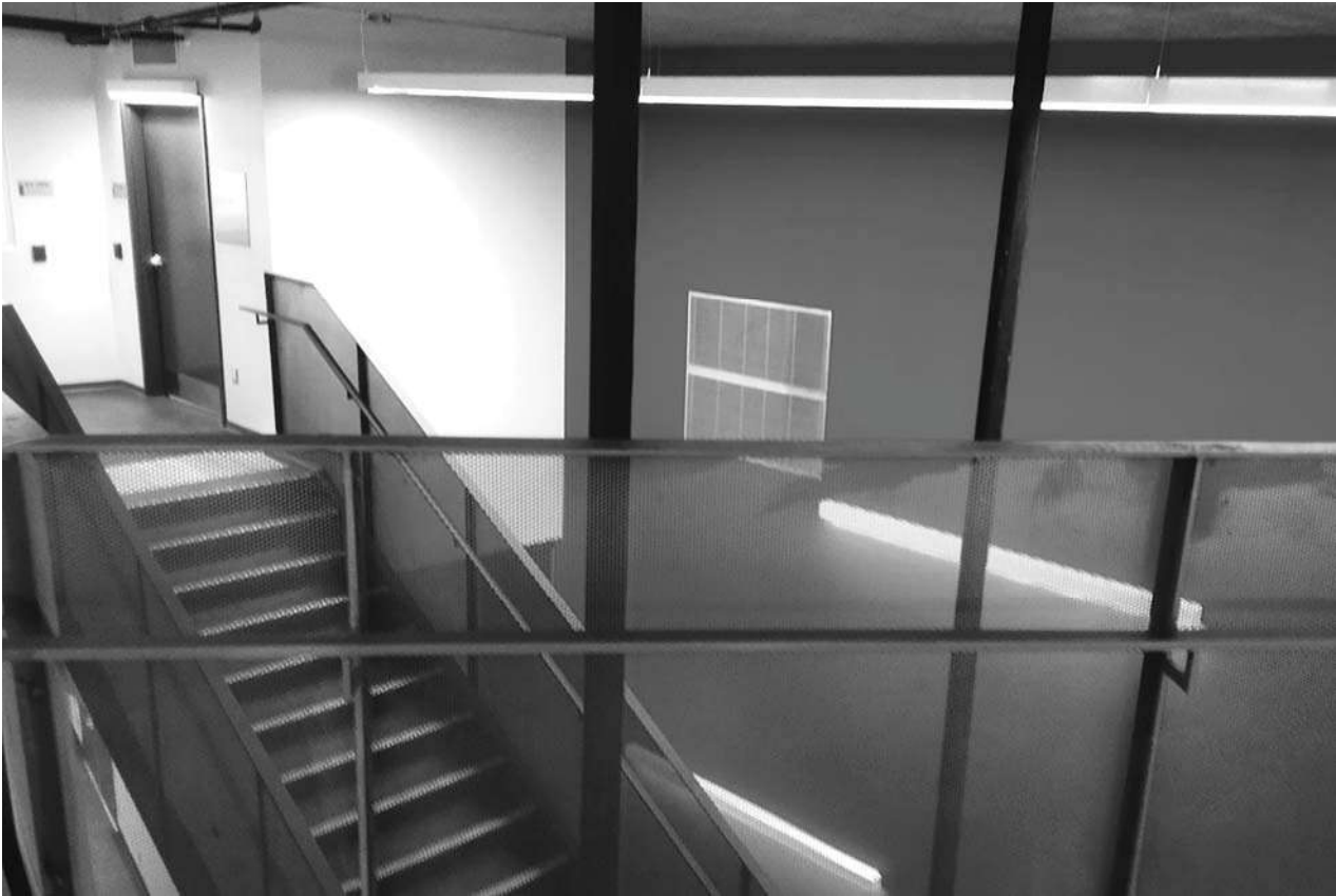
Fig. 2. School of Performance, main staircase.