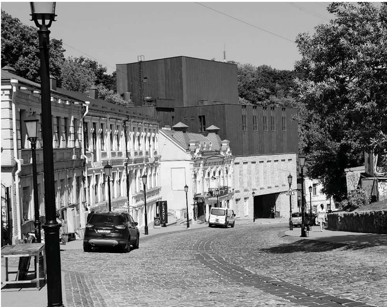
Fig. 13. Kyiv Academician Theatre of the Podil.

We would like our theatre pedagogue to work with the little kids while the parents are enjoying the show; thus, it will be an interesting evening for the entire family..."