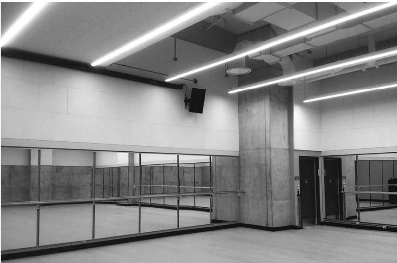
Fig. 3. School of Performance, dance studio.