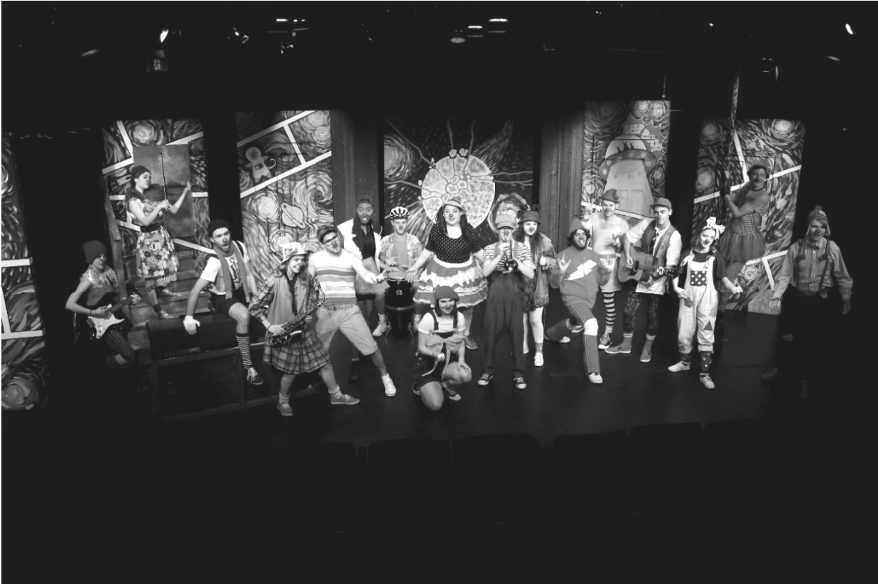
Fig. 10. Various performances and rehearsals in the new flexible Studio Theatre.