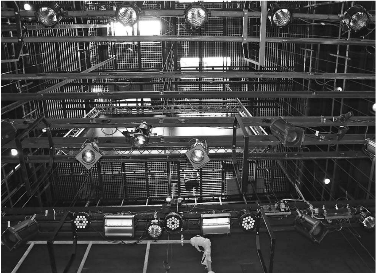
Fig. 14. Kyiv Academician Theatre of the Podil.

Opinion of Oleksandr Riabenko, Theatre Engineer: I'd like to stress out that this theatre is based on the ideas of transformation.