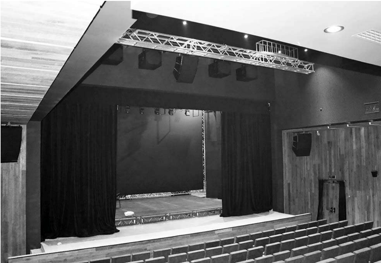
Fig. 15. Kyiv Academician Theatre of the Podil.

There is a rain machine here that uses real water, which may circulate even for the entire duration of the show.”