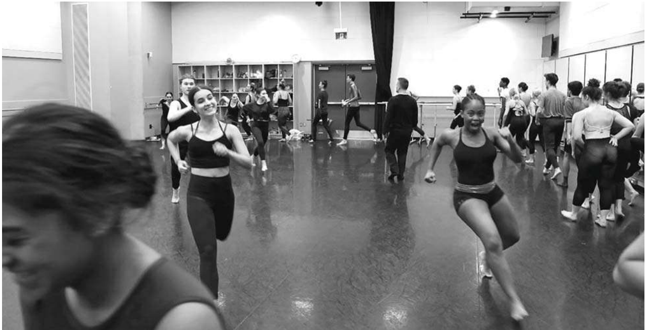
Fig. 4. School of Performance, dance studio/performance space.