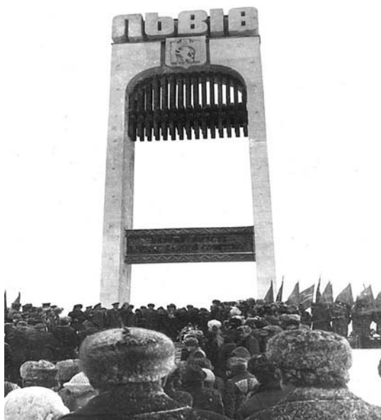
Fig. 3. Sign in honor of the reunification of Ukrainian lands. Opened in 1982 (from the author’s private records)