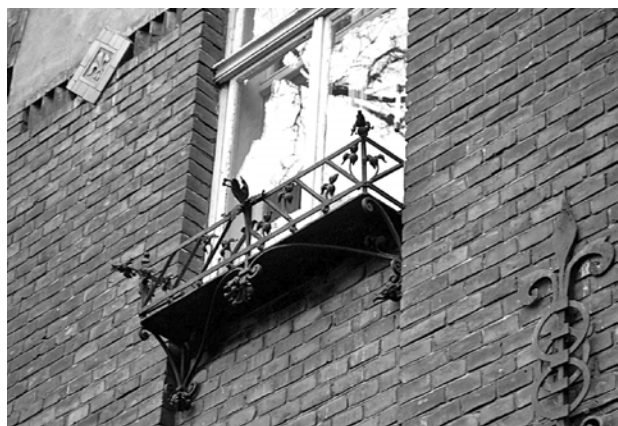
Fig. 4. Jardiniere of the beginning of the 20 th century: a – on the balconies in the courtyard, 16 Tarnavskyj Str. Photo by S. Leonov; b – in the interior space (staircase) of the rental house, 5 Horska Str. Photo by S. Leonov