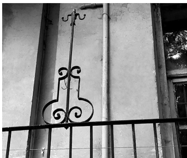
Fig. 3. A jardiniere of the early 20 th century: a – decorative Art Nouveau, with a stylized floral ornament (Str. Rudanskyi,1); b – Rational Secession, 22, Kotlyarevskyi Str.