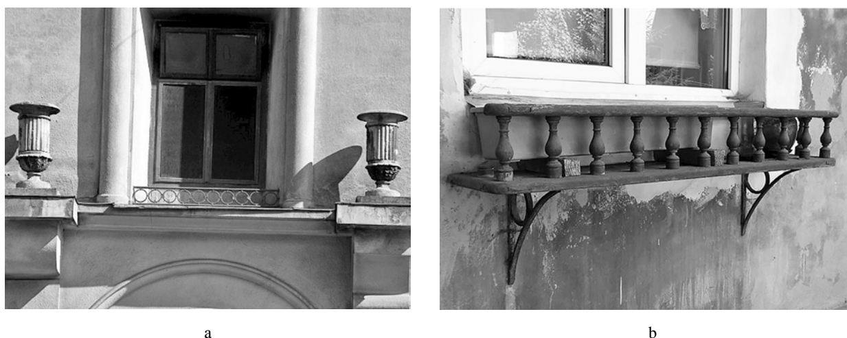
Fig. 2. Jardinières of the nineteenth century: a – the half of the XIX c. – stone vases on both sides of windows and a metal jardiniere on the window-sill, Horodotska Str., 20. Photo by T. Kazantseva; b – the end of the 19 th century. The unique preserved wooden jardiniere, Chekhov Str., 28. Photo by S. Leonov