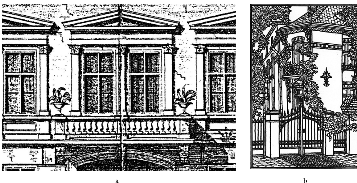
Fig. 1. The greening of the façade as part of the architectural and artistic image of the building: a – prediction vases on flowers at the stage of project archival drawings (Lychakivs'ka Str., 15); b – braid building facade vines of wild grapes (Str. Kotlyarevskyi, 41) (the author: T. Kazantseva)

The city “vertical gardening” is very important as well, known still from the gardens of Babylon and improved by Patrick Blanc in the twentieth century. Frank Lloyd Wright advised to use it to hide the failures of an architect. In one of student competitions in streamlining of Mickiewicz Square the designers cleverly used climbing plants to save the monument from the aggressive visual impact of the building “Ukrsotsbank”. This practice of integrating a modern building in the historic environment exists in the world, as an example we can cite the expanding of the old hotel in the city of Amiens (France). The modern part of it was adorned with vertical greening [5].