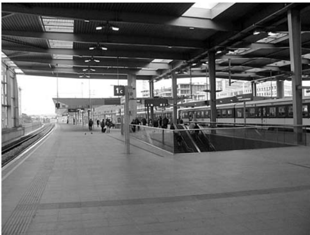
Fig. 1. The platform of the Praterstern railway station in Vienna.

At the formation of the railway passenger node the concept of approaching of landing to other types of public transport is being implemented. The idea of a short barrier-free communication requires introduction of ramps, elevators since the lines of internal urban railways have to avoid the crossings of the tracks at one level with motor ways. This spatial-transport conflict is solved by the way of separating the movement on different levels (Fig. 1, 2).