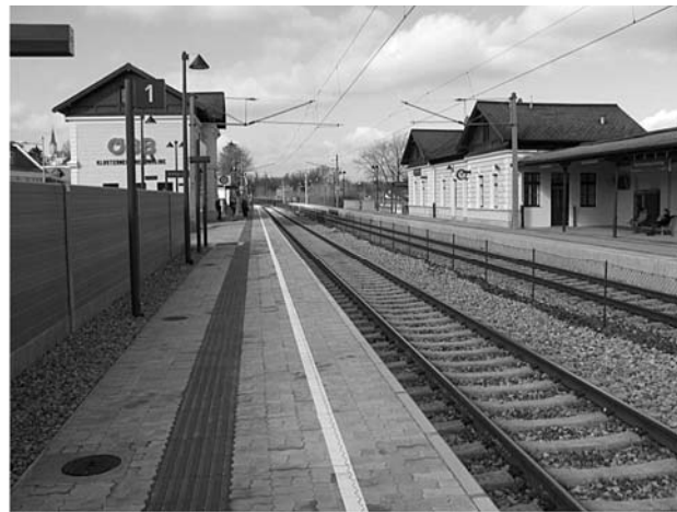
Fig. 2. Klosterneuburg-Kierling stop for the urban and suburban trains. Lower Austria.

Intensification of passenger rail transportation motivates active use of the existing resource. For quick reaching of the city center or nodal stations of public transport more intermediate stops at the end stations are arranged even for distant and high-speed trains, as, for example, in Budapest (Kelenföld), Vienna (Meidling), Lviv (Pidzamche), Kyiv (Darnytsia) and others. There is also a trend in laying of tracks to the airports as the end railway stations for distant and high-speed trains (the Vienna airport). Thus in some cities there is a separate railway for the transportation of passengers to the airports from the railway stations and other transport means.