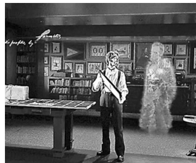
Fig. 5. Holographic installation at the Abraham Lincoln Museum, Springfield, USA. Realization: BRC Imagination Arts [8]

Occasionally, the image of lost or damaged elements and structures of architectural and urban architectural ensembles is reproduced by means of temporary or permanent installations that do not ruin the environment and preserved parts of the monument. This may be, for example, a transparent screen with a drawn image that, from a certain point of view that shows the original appearance of the monument (Fig. 3), or a light model made of a metal mesh (Fig. 4). In combination with the multimedia exhibition technologies, such solutions will become even more appealing to the visitor. For example, a conventional glass screen, similar to the one mentioned above, is used for a holographic installation in the Museum of Abraham Lincoln, Springfield, USA (Fig. 5).