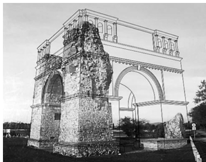
Fig. 3. Reconstructive model in the Carnuntum Archaeological Park, Austria. Scientific developer: Ludwig Boltzmann Institute [6]