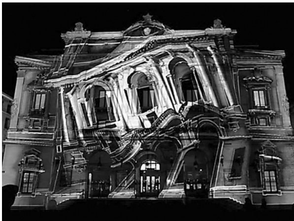
Fig. 1. 3D mapping in Lyon, France. Project by 1024 Architecture [2]