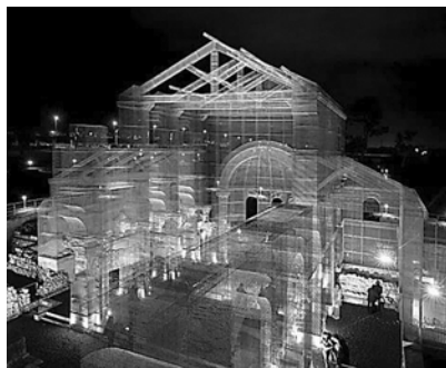
Fig. 4. Reconstructive model in the Siponto historical park, Italy. Author: Edoardo Tresoldy [7]