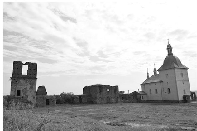
Fig. 2. Transfiguration Monastery in Pidhora village. Foto 2017