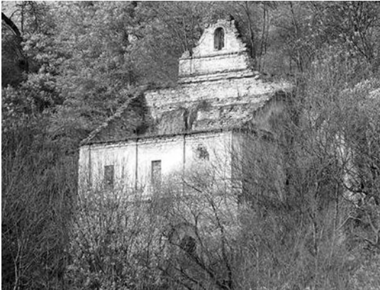
Fig. 5. Ruins of the monastery cave churches in Ulashkivtsi. Photo 2014