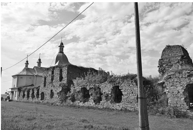
Fig. 1. Transfiguration Monastery in Pidhora village. Foto 2017

All supplements of losses in the masonry of building mortar, stone, splicing of cracks must be performed by solutions, similar in composition to the authentic (lime and sandy solution).