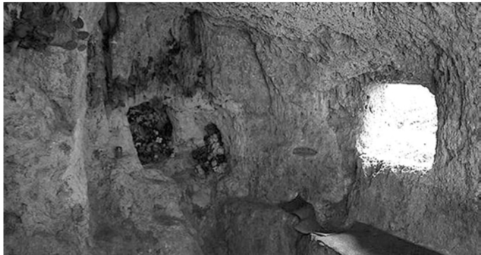
Fig. 6. Ruins of the monastery cave-cell churches in Ulashkivtsi. Photo 2014