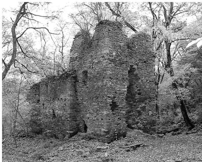
Fig. 3. The church's ruins in the tract Monastirok. Photo 2014