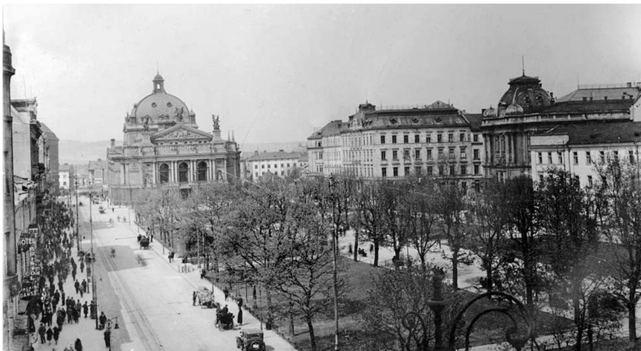
Fig. 1. The view on Karl Ludvig Avenue (today – Svobody Avenue) on Hetmanski Valy in Lviv. Photo of early XX century

In urban spaces forming natural features played an important role: putting Poltva River into the collector and creating Karl Ludvig Avenue (today Svobody Avenue) on Hetmanski Valy created compositional axis, which stretched to the newly built city theatre and continued along the underground river Poltva (today Shevchenko Avenue) (Fig. 1). Hetmanski and Hubernatorski Valy became the planning basement for Boulevard Ring – “Lviv’s Corso” like in European cities – “Krakiv’s planty” or “Ring in Wien”.