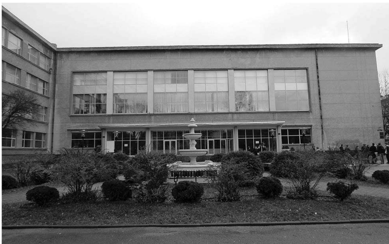
Pic. 2. The main façade of the first academic building from Konovalts St. in Lviv

But in the early twentieth century not only the technical and technological but also the functional capacities of the hall were exhausted. The contingent of students in Lviv Polytechnic National University has grown to 40,000; their cultural and aesthetic needs have increased.