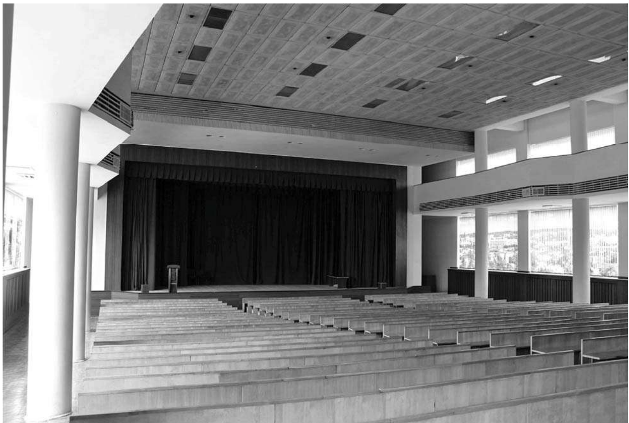
Fig. 1. General view of the ground floor and balconies of the assembly hall of the first academic building. Current state.

The first academic building with a hall for 1000 seats was designed by Prof. I. Bagensky, R. Lipka, A. Rudnitsky. The building was commissioned in 1965 and is not well described in scientific publications.