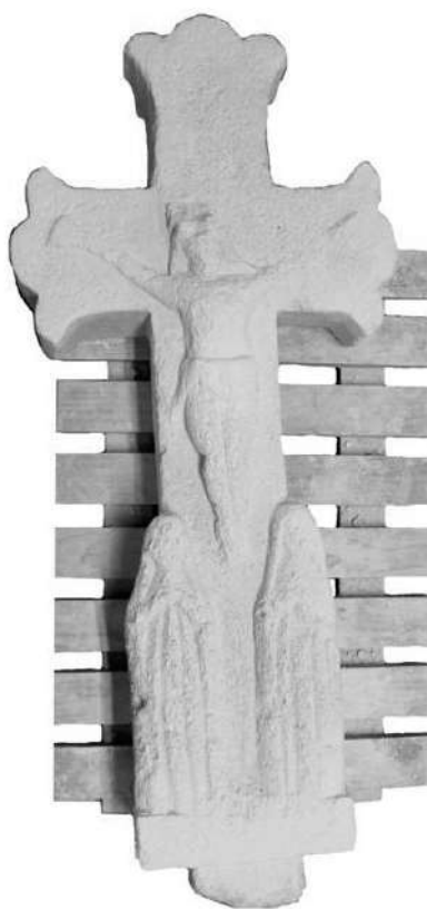
Fig. 4. Object after performing of conservation work.

Most seriously damaged monument in the form of a cross with the Crucifixion and coming receipt for conservation in 2017. The cross comes from the non-existent Ukrainian village of Sukha Volya, which is currently located in the Podkarpackie Voivodship of the Republic of Poland. At the time of receipt for conservation, the condition of the object was critical. Crucifixion was broken into nine separate parts (Fig. 5). The crucifix itself was broken into two part, the right figure from the cross was broken into two, the left – for three parts. Two more parts were repulsed from the corners of the cross, from the upper and lower. Probably the stone cross broke down when falling. For a long time, the monument was underground so the time of receipt for the conservation it was very dirty. Pores contain a large number of different types of biodeteriorations. The conservation was carried out by student Vlasyuk Julia. According to the technique of execution and the origin of the monument was attributed to the Brusno stonemasonry school. During the conservation, the cross was cleared of surface contaminants and biodeteriorations that were found in limestone pores. After complete cleaning, connection and gluing of parts of the stone cross, as well as addition of lost elements were carried out. The object was strengthened and colore unification was carried out (Fig. 6).