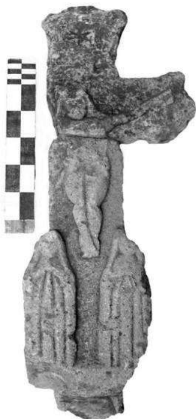
Fig. 3. Object at the time of receipt for conservation