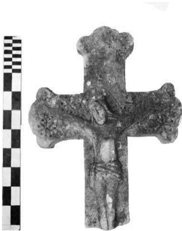
Fig. 1. Object at the time of receipt for conservation

The next gravestone monument in the form of a cross with the coming, which entered the conservation in 2018, was damaged already much more seriously (Fig. 3). At the time of receipt for conservation the cross was broken into two parts, there was no left arm, the body of Jesus, the drapery, the wreath on the head of Jesus, the heads of the coming were damaged. The monument was covered with dust and dirt, mosses. The monument was thoroughly cleared of pollution and mosses. All parts were glued and armed. The losses have been supplemented the left arm of the cross, the end of the right arm, the body of Jesus, the heads of the coming (Fig. 4).