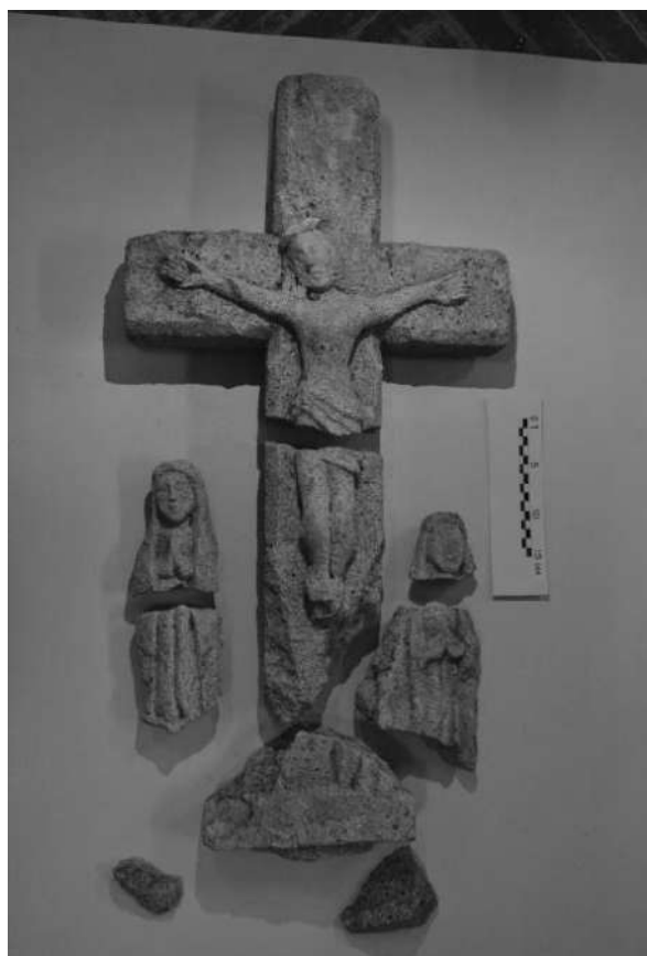
Fig. 5. Object at the time of receipt for conservation