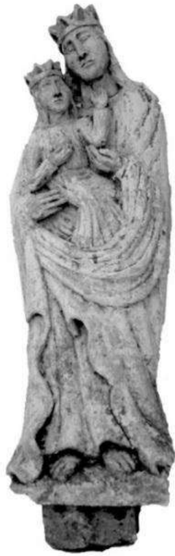
Fig. 7. Object at the time of receipt for conservation