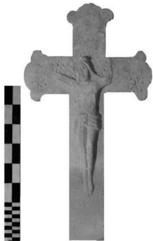
Fig. 2. Object after performing of conservation work