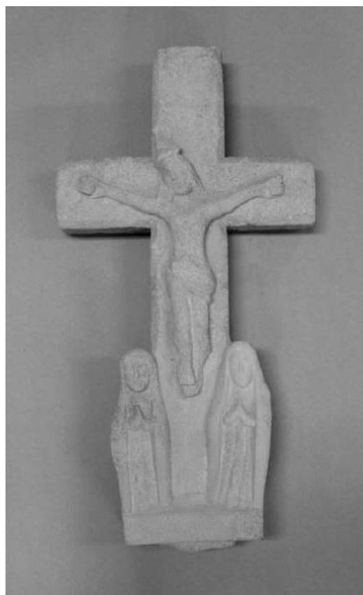
Fig. 6. Object after performing of conservation work