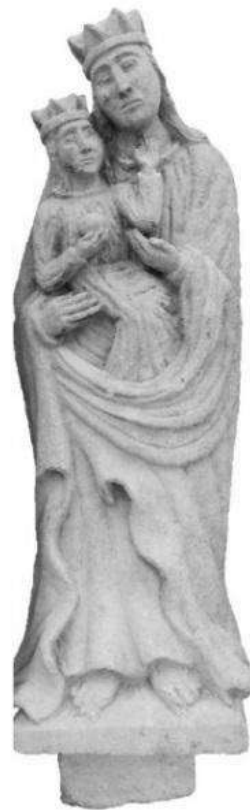
Fig. 8. Object after performing of conservation work