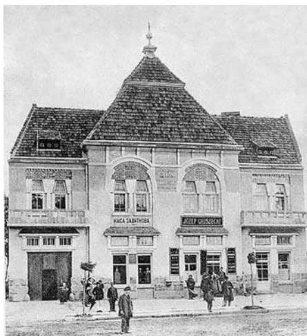
Fig. 1. People's House in Kamianka-Buzka. (Tsentris'koyi istoriyi Tsentral'no-Skhidnoyi Yevropy. People's House in Kamianka-Buzka . [online] Available at: < http://www.lvivcenter.org/uk/uid/picture/?pictureid=4251 > [Date of reference 10 April 2020])

People's House in Kamianka-Buzka (Fig. 1), built by I. Levynskyi's firm under the project of O. Lushpynsky in 1911–1912, also has a rich theatrical history. The architectural expressiveness of the building is enhanced by the embellished plasticity of the walls, complemented by friezes and inserts of greenish-blue majolica tiles, and a sophisticated central risolite. On the second floor, twin windows with sloping corners, a significant element of Ukrainian modernism, were used, which became widespread in Central and Eastern Ukraine and has just begun to take root in the Western region. The high expressiveness is gained owing to the high roof in the form of a four-slope tent. Despite its small size, this house is monumental and harmonious with respect to the person it dignifies rather than inhibits. In 1914, the actors of the Ukrainian Theater "Ruska Besida" staged the drama "Ukradene Shchastya" by Ivan Franko at the People's House. The legendary Les Kurbas was in the cast.