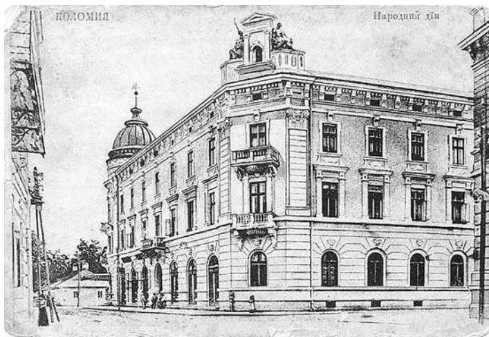
Fig. 2. People's House in Kolomyia. (Natsional'nyy muzey narodnoho mystetstva Hutsul'shchyny ta Pokuttya. Kolomyia. People's House. Postcard of the early twentieth century . [online] Available at: < http://hutsul.museum/museum/history/overview/ > [Date of reference 11 April 2020])

At the beginning of the 20th century with the rapid rise of theatrical art in Lviv and Galicia, a large number of dramatic groups have been established. This gave impetus to the change of planning decisions of cultural and educational buildings, and then almost every one of them provided space for theater auditorium.