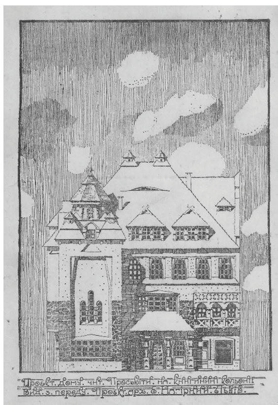
Fig. 3. The project of the "Prosvita"

The sketch of the People's House in Syanok (Fig. 3) is the evidence to the fact that one of the methods of shaping the architecture of Ukrainian cultural and educational buildings is the synthesis of the architectural layout of the Ukrainian house and the Ukrainian church. The features of a more perfect spatial organization are already seen here: the stairs and the capacious halls become the center of functional planning, around which various genres of activity are created. The premises that serve the stage and the hall are united in a single zone (Cherkes B., Hrytsyuk L. 1991, s. 92–93).