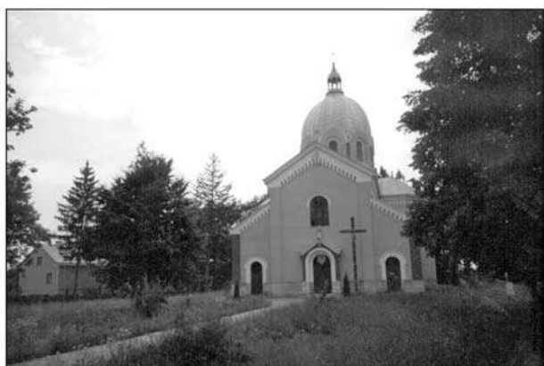
Fig. 1. Church in the village of Bilyi Kamin, Zolochiv district, built upon the project of Vasyl Nahirnyi in 1910; photo by S. Topylko, 2003

Furthermore, sacral objects still remained the most stable planning and compositional elements of small towns. There was a noticeable tendency to a reconstruction of sacral objects and the building of new, usually larger ones. The famous Galician architect Vasyl Nahirnyi designed a number of stone churches that were built in the researched towns at the end of the 19th – in early 20th century in Bilyi Kamin (1900), Bohorodchany (?), Velyki Mosty (1893), Dovhomostyska (1908), Kalush (1913), Klebanivka (1898), Kopychyntsi (1900), Leshniv (1905), Mykolayiv (1903), Vytktiv (Novyi)(1910), Yarychiv (Novyi) (1889), Novi Strilyshcha (1910-30), Sasiv (1895 (1898)), Skole (1892), Solotvyno (1904), Toporiv (?) (V. Slobodian, 1994, pp. 30–33). As a rule, churches were built on the place of the lost old sacral buildings (Fig. 1–3).