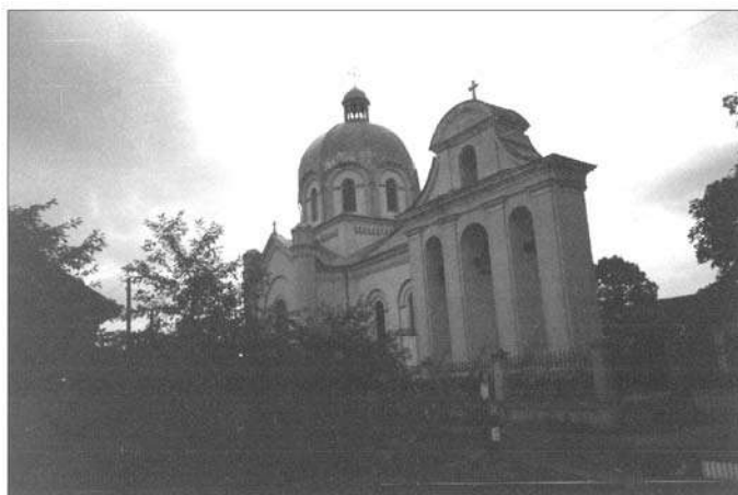
Fig. 3. Church in the village of Sasiv, Zolochiv district, built upon the project of Vasyl Nahirnyi in 1895

The architectural heritage of Vasyl Nahirnyi counts several hundreds of objects including churches, chapels, parochial houses, public and private buildings. The most valuable are village churches that make up the