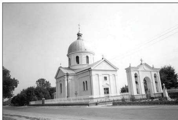
Fig. 2. Church in the village of Novyi Vytktiv, Radekhiv district, built upon the project of Vasyl Nahirnyi in 1900