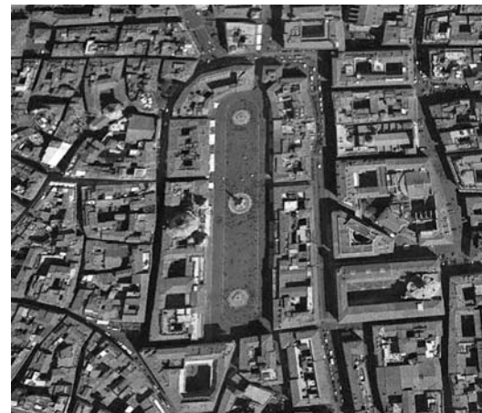
Fig. 3. The church Sant'Agnese in Agone and Piazza Navona.