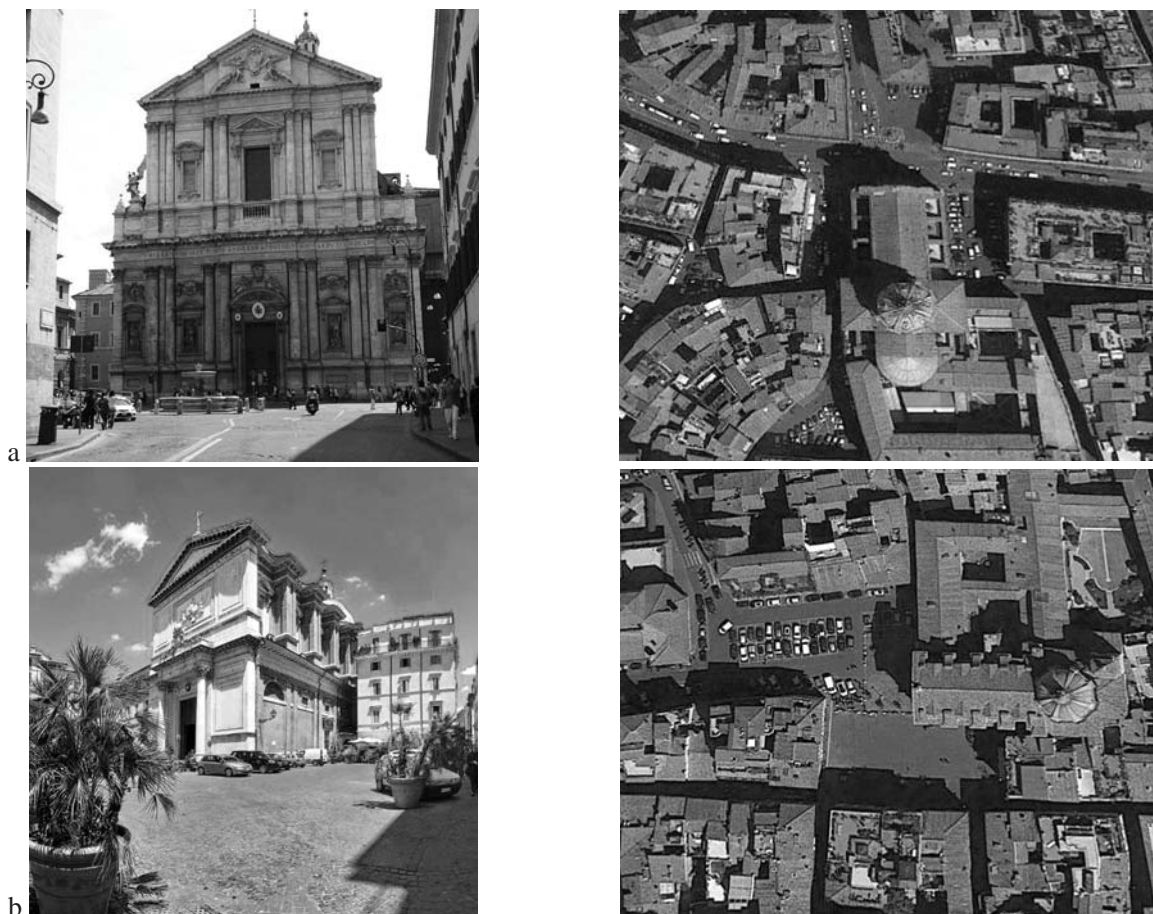
Fig. 1. Examples of sacred squares arrangement: a – Church of St. Julian of the Flemings; b – Church of San Salvatore in Lauro

The experience of Italy, where the warm climate and dense urban development patterns are predominant is worth mentioning here. For example, in Rome, at the end of the nineteenth century, there are 255 churches and 21 of them are attached on one side; 96 – attached on both sides; 110 are attached on three sides; 2 attached on four sides and only 6 are free standing ones (Sitte, 1889). This arrangement of objects of sacred architecture has proved itself as the one having more positive features of their perception by the viewers. The church view is opened only from the “correct” side, creating a unique perception pattern. These visually limited areas provide an opportunity to focus on spiritual qualities: Church of St. Julian of the Flemings; Church of San Salvatore in Lauro; Church of Santa Maria Maddalena (Fig. 1). And the Church of Sant'Ivo alla Sapienza can only be seen from the courtyard (Fig. 2).