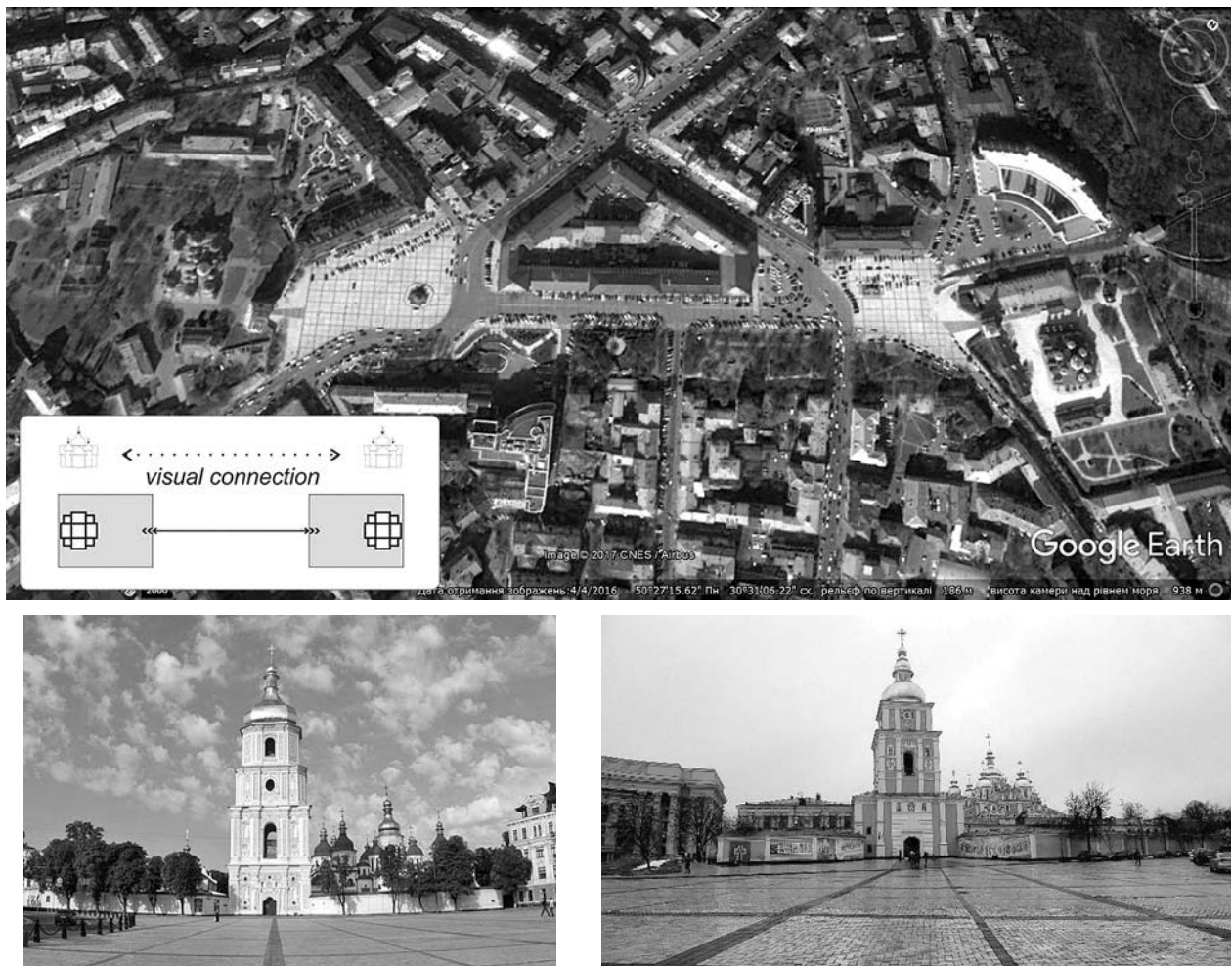
Fig. 5. Organization of the sacred space of St. Sophia Cathedral and St. Michael's Golden-domed Monastery in Kyiv.

While forming the spatial structure of historical cities, the streets were laid in the direction to its dominants – the sacral objects. Thus, the facades of the surrounding buildings create a foreground that led the viewer's sight to the temple, thereby enhancing its significance, and the street gains a compositional perfection (Koznarska, 2011). Combination of several sacral spaces into a single compositional structure provides a sound basis for shaping the image of the city. Thus, the image of Kyiv is formed on the basis of a sacral center which includes two sacral complexes: the St. Sophia Cathedral and the St. Michael's Golden-domed monastery, the sacral squares of which are connected by Volodymyrsky Avenue (Fig. 5).