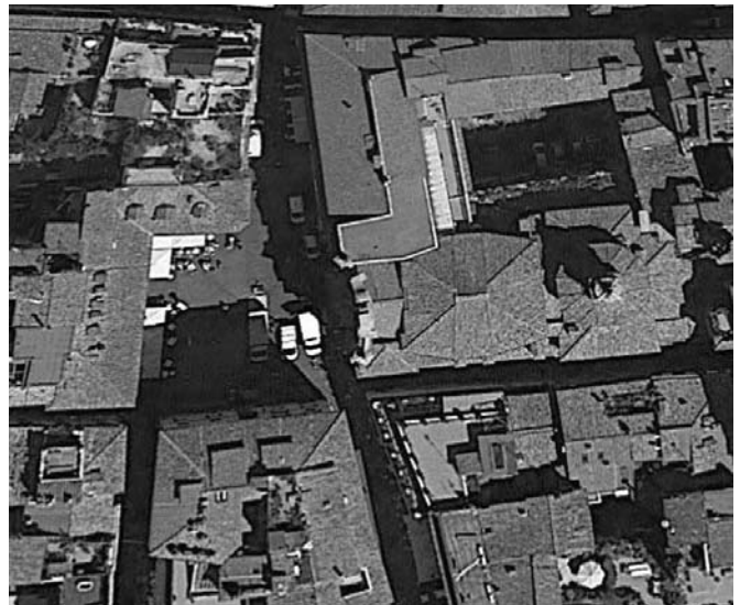
Fig. 1. Examples of sacred squares arrangement: c – Church of Santa Maria Maddalena.