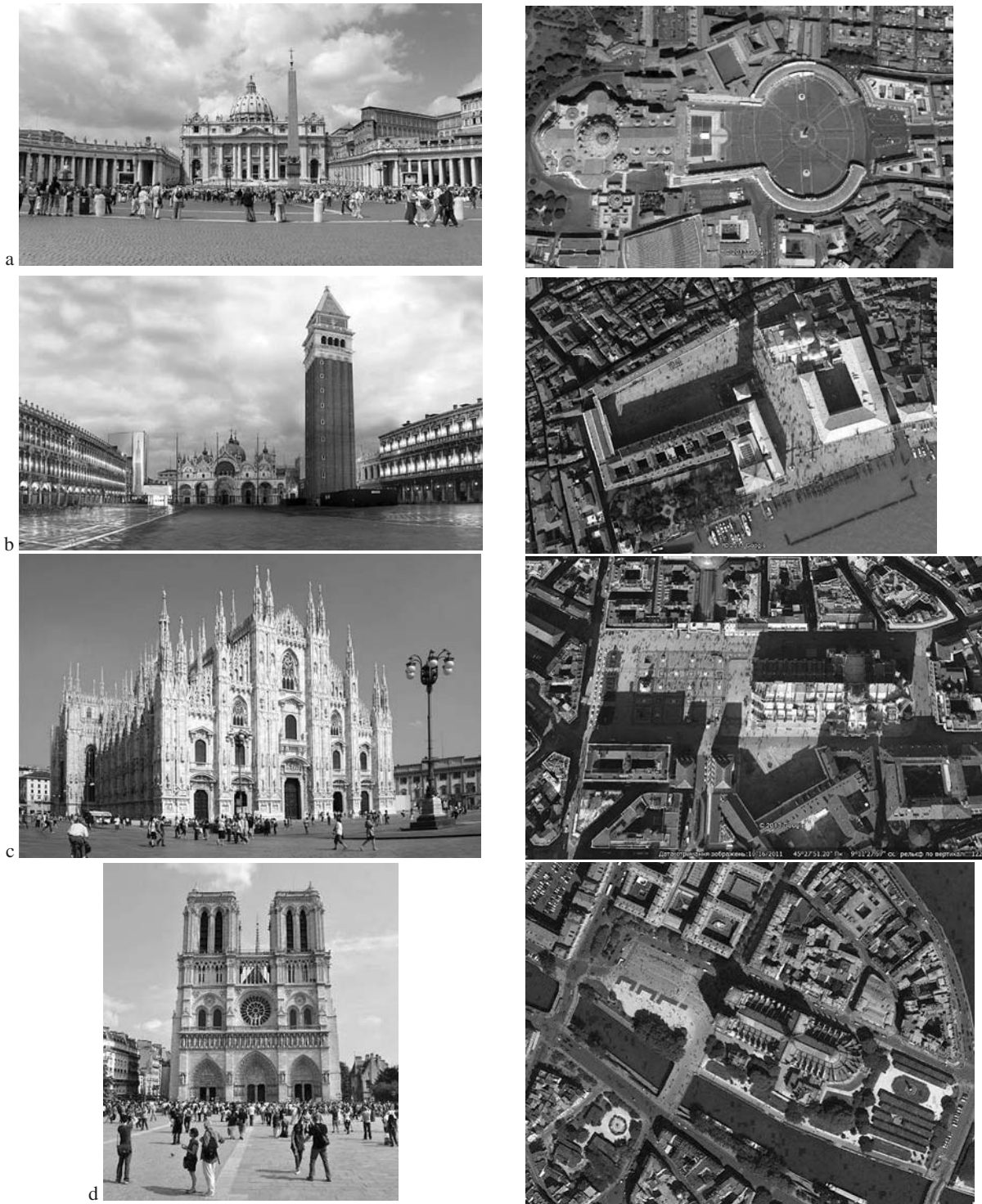
Fig. 4. Examples of sacred squares arrangement: a – the Cathedral of St. Peter in Rome; b – the Cathedral of St. Mark in Venice; c – the Cathedral of Milan; d – the Cathedral of Our Lady of Paris.

If we analyze the most magnificent churches in Europe: the Cathedral of St. Peter in Rome, the Cathedral of St. Mark in Venice, the Cathedral of Milan, the Cathedral of Our Lady of Paris, etc., it should be noted that the sacral space of their squares is resolved flawlessly from an aesthetic point of view and enhances the greatness and the weight of the temple. According to the theory of vision, for the best perception of the object of architecture, it is necessary to provide an optimal vertical angle of 27 degrees view (that is a distance equal to two heights of the object) (Koznarska, 2014). Actually, these principles, in this case, are clearly elaborated, therefore, in front of the main facade there is an elongated square from which you can examine all the greatness of architecture (Fig. 4).