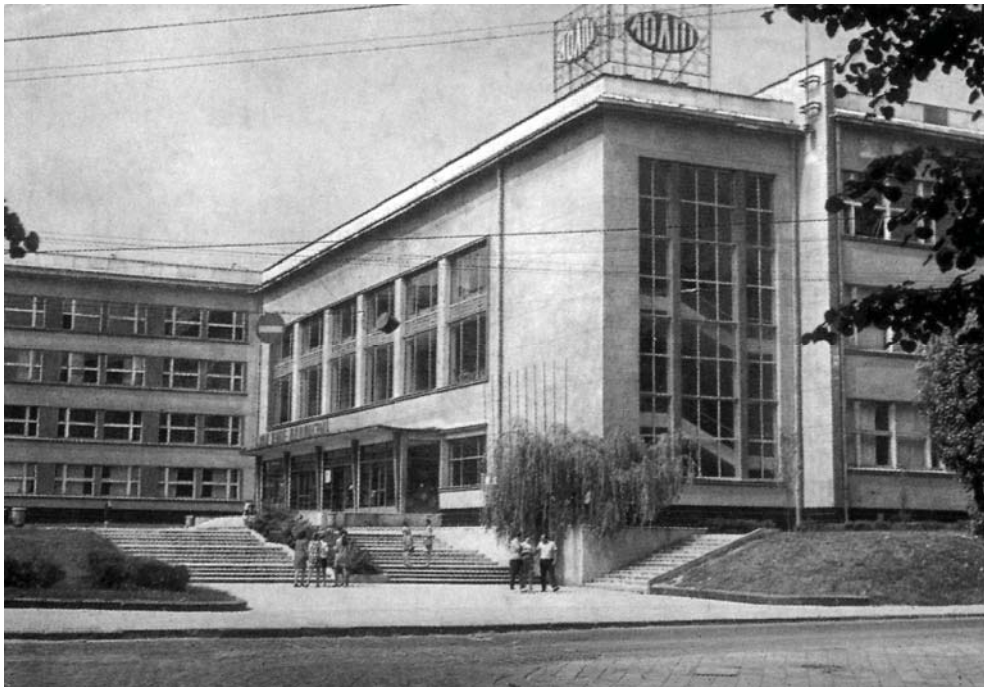
Fig. 4. Lviv Polytechnic teaching building No.1 (Postcard from the authors' archive, 1971)

of the entire ensemble. Continuing this tradition, Andriy Rudnytskyi very successfully fitted his building into the historical ensemble of the street. In front of the new building, he designed a landscaped square, and the architecture of the building itself combines functionality with a concise but gracefully proportional architectural solution. It was not easy to do during an aggressive “struggle with excesses” in architecture: the construction of the teaching building No. 1 was completed in 1966. Professor Rudnytskyi was awarded the state prize for the developed project.