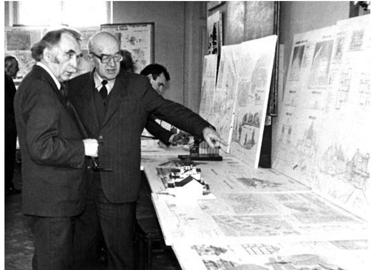
Fig. 2. Viewing student's works, 1980s; photo from the authors' archive

The factual material of the biography of Andriy Rudnytskyi does not represent a complete list of the main stages of his development, just the most significant professional and scientific achievements. The name of this person is associated with the Lviv architectural school, which not only survived in the conditions of the totalitarian Soviet “equalization” but also managed to preserve its unique tradition. The architectural school of Lviv was the subject of scientific research in numerous studies. In the circles of architectural education of the 1960s–80s, it deserved the same respect as the architectural schools of the Baltic republics, Moscow, Leningrad, Kazan, and Tbilisi, which in the architectural field of the former USSR were considered to be generators of new and creative ideas. For example, in the article on results of the contest for the best diploma projects in the field of architecture, held in 1978 in the city of Tallinn, with the participation of 247 projects from 44 architectural institutions of the USSR, we find: