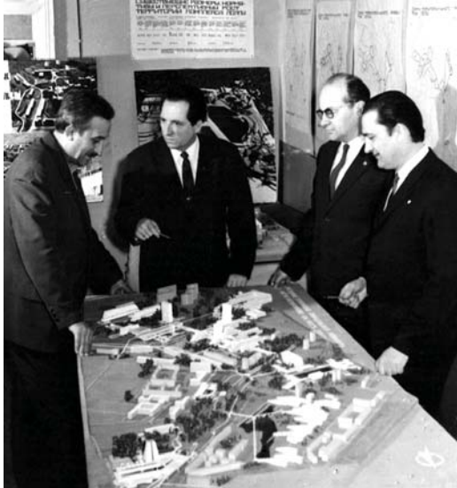
Fig. 7. At the project discussion in SDB LPI, 1970s