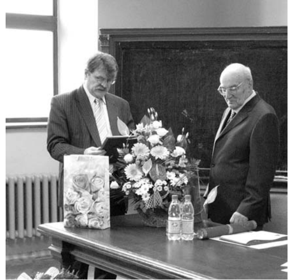
Fig. 8. Congratulations at the 80 th anniversary, 2008