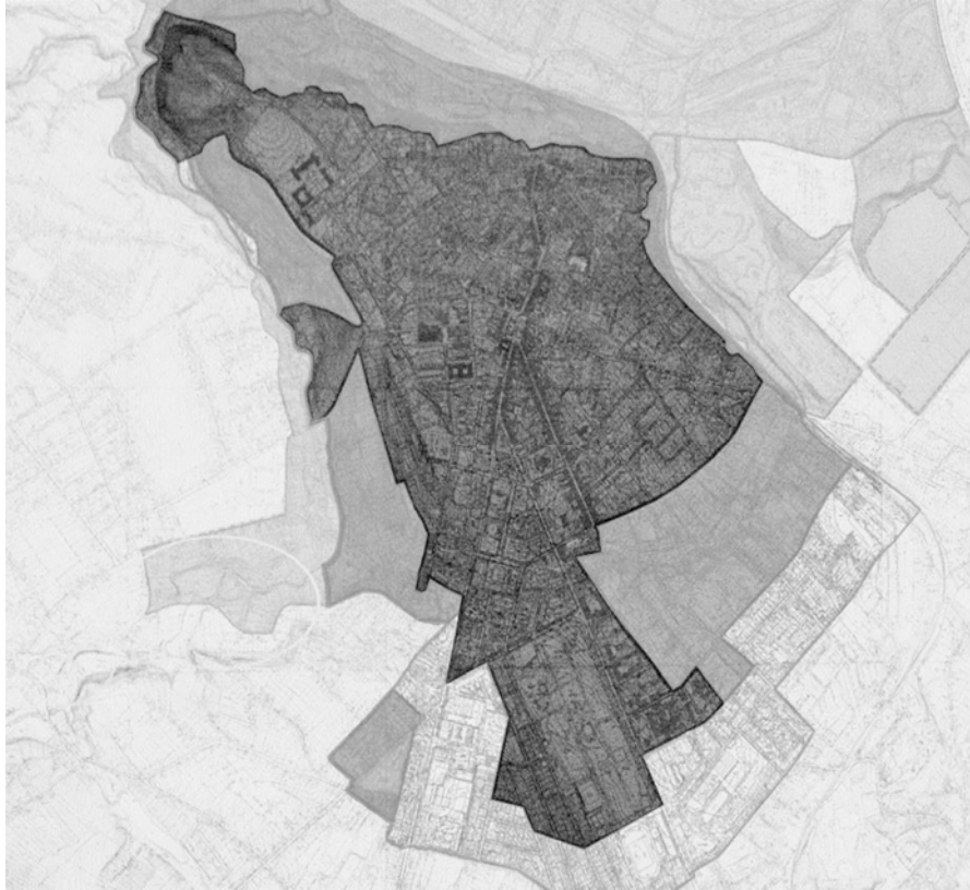
Fig. 1. Complex protective zone of Chernivtsi within a central historic area