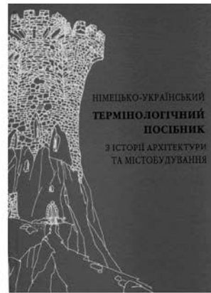
Deutsch-ukrainischer Terminologie-Leitfaden zur Geschichte der Architektur und Stadtplanung ed. H. Petryshyn (Works of Ukrainian Centre for City Historical Studies, Issue 3), 2006