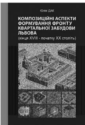
Idak Yu., Compositional Aspects of the Formation of the Front of Quarterly Building of Lviv (the end of XVIII – early 20th centuries) / (Works of Ukrainian Centre for Historical City-studies; Issue 7), 2011