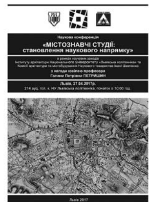
Scientific conference “Mistoznavstvo/city-studies: formation of a scientific field”, 2017