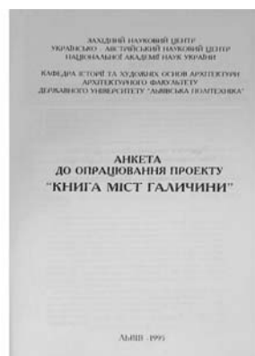
Survey for the study of the project “Book on the Cities of Halychyna (Galicia)”, 1995