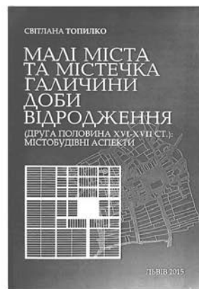
Topylko S., Towns and Small Towns of Galicia during the Renaissance period (second half of the 16 th –17 th centuries): urban-related aspects (Works of Ukrainian Centre for City Historical Studies, Issue 6), 2015