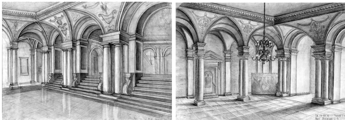
Fig. 2. Interior of the lobby of the Lviv Polytechnic National University (student works by: Naumchuk O., Tkachuk G., headed by O. Bilinska, 2014, 2015). Technique: A2 paper size, pencil

The purpose of the drawing by students-architects is to master the fundamentals of the graphic language of academic drawing and compositions; study of methods of quick drawing, sketching; development of technology of linear, tonal drawing. The specific goal of the task is to study the perspective and constructive creation of a fragment of the interior of a public building, assimilate the ways of transferring the depth of space, linear scale, revealing the proportional features of perspective contractions of architectural elements in the interior (ordering: pilasters, columns) and distances between them, displaying air perspective by detecting light, shadow, contrast, environmental impact via active lines and local tones. In an academic approach, it is important to perform classical productions for the process of architectural drawing. The creative process of the architectural design of the interior is based on successive stages.