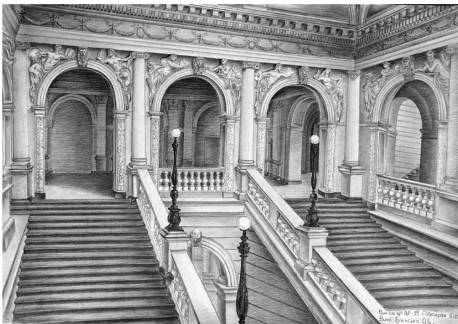
Fig. 5. Interiors of the 2nd floor of the Lviv Polytechnic National University (student work by Pivtorak Yu., headed by O. Bilinska, 2015). Technique: A2 paper size, pencil

The third stage – selecting only one sketch and the optimal angle. You can tone different sketches to find one you're satisfied with. You can use tone on small sketches, setting the tonal difference between the perpendicular planes of the interior. Next, the potential of future graphic work is compared, and the idea of how best to portray a solution is formed.