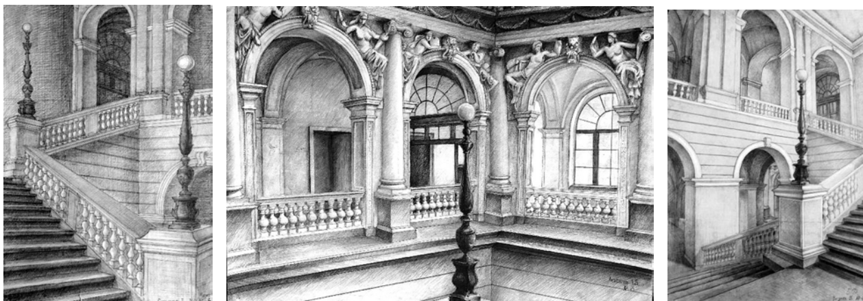
Fig. 7. Interior of the second floor corridor and staircase of the Lviv Polytechnic National University (student works by: Dmitryv K., Lyzanets' I., Voznyak V., headed by O. Bilinska, 2014, 2015). Technique: A2 paper size, pencil

In the final stage, a clear interpretation of plans and generalization of the fragment of the interior of the public building, are common. Errors with inappropriate tinting of the interior perspective are relatively insignificant with regard to the wrong linear perspective, and they can be fixed (obscured, highlighted fragments) in the process of completing the interior drawing.