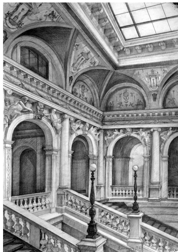
Fig. 4. Interiors of the lobby and stairs of the 2nd floor of the Lviv Polytechnic National University (student works by: Rakochny Ya., Dushenchuk T., headed by O. Bilinska, 2014, 2015). Technique: A2 paper size, pencil

The first stage is the formation of a problem. Study of the content of form and space: an understanding the structure of the interior in terms of space organization, geometric design (framework, connecting each other in the space of individual elements, parts in a single image) and plastic structure. This is an imaginary layout of a graphic image of an interior fragment: the partitioning of interior planes by columns or pilasters, ending with