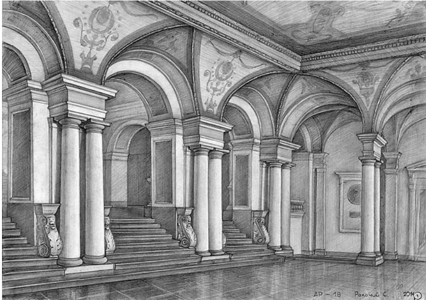
Fig. 3. Interior of the lobby of the Lviv Polytechnic National University (student work by Rakochny S., headed by O. Bilinska, 2014). Technique: A2 paper size, pencil