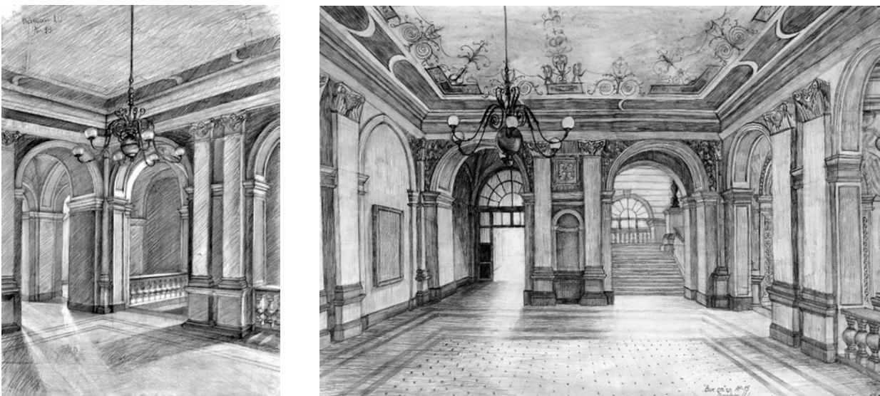
Fig. 6. Interiors of the 2nd floor of the Lviv Polytechnic National University (student works by: Petryshyn A., Popadyuk O., headed by O.Bilinska, 2014, 2015). Technique: A2 paper size, pencil