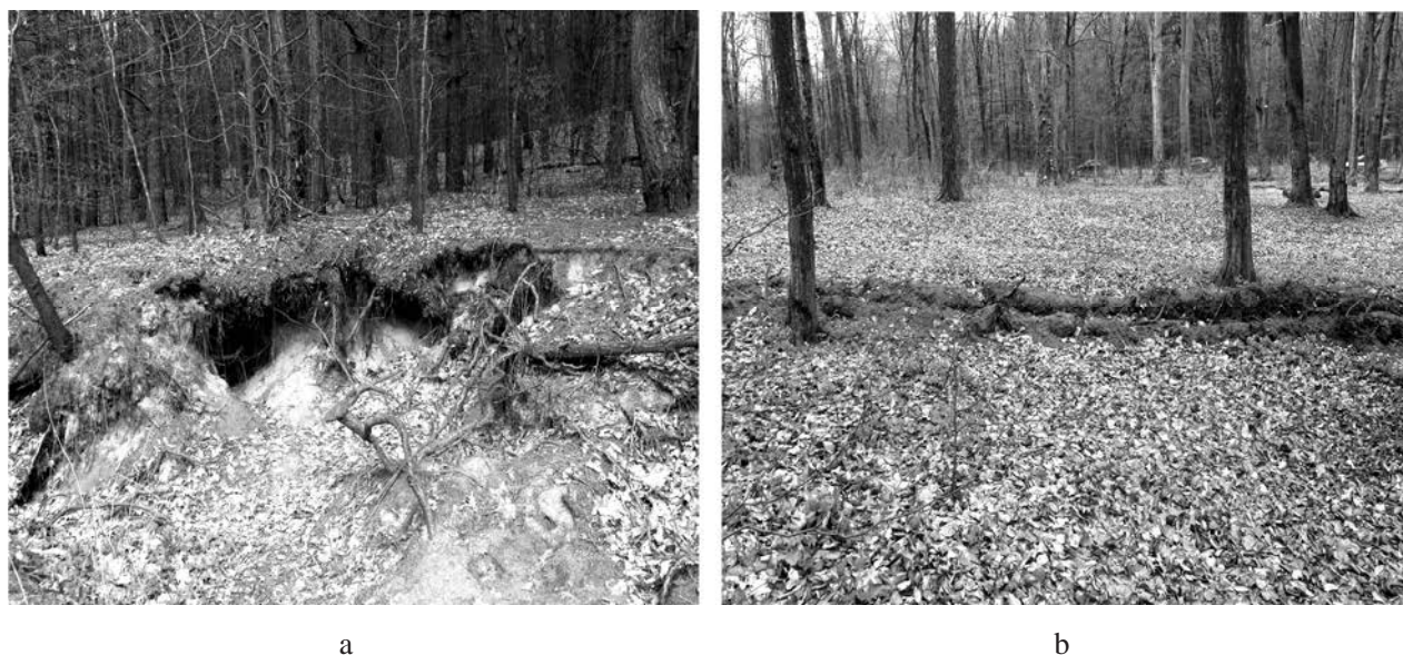
Fig. 3. The degradation of the Bryukhovitsky Forest Park: a – erosion processes in the forest park area; b – the unauthorized arrival of vehicles in the forest park area (H. Lukashchuk, 2016)

However, despite the significant transformation of the territories of the forest parks, species of vascular plants that are included in the Red Data Book of Ukraine are preserved in their territories. In most cases they are spring ephemerals. The prevalence of the forest species and the presence of rare species is evidence of a high level of sustainability of natural forest ecosystems. At the same time, the formation of specific groups of spontaneous vegetation within the forest parks on the outskirts of Lviv depends on the intensity and nature of the use of the territory. The vitality of phytocenoses of forest parks is negatively affected by soil redevelopment. Excessive attendance leads to a violation of the links between the components of the forest, the loss of resistance to the forest planting, and in some cases – to its complete disorder (H. B. Lukashchuk, T. A. Fedorchuk, 2015). Typical vertical structure has survived in plantations, which by origin and composition are indigenous (Vynnyky forest park, Pohulianka forest park). Differentiation of the first and second wood tiers, brushwood, undergrowth and grassy tiers is observed as well.