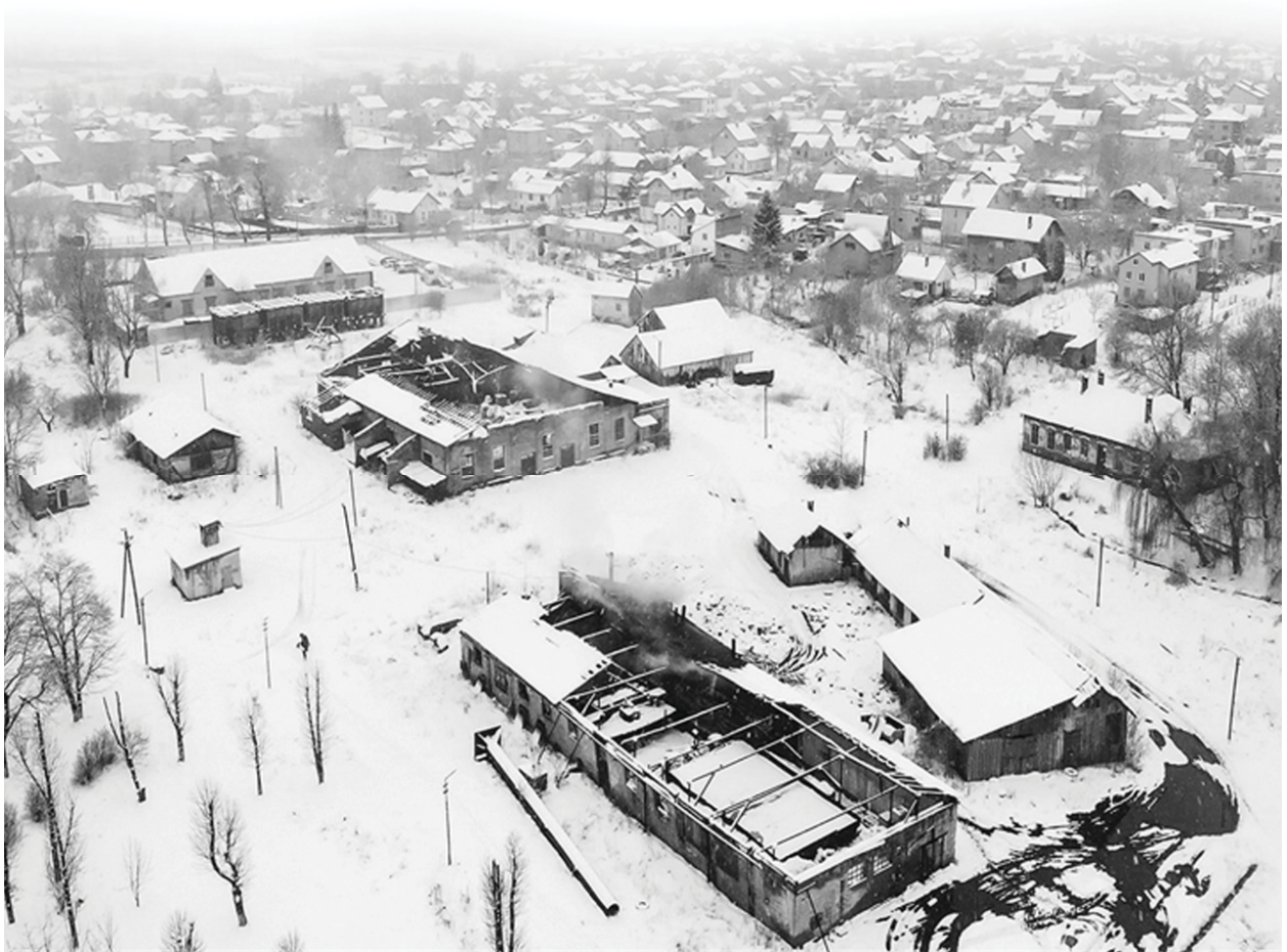
Fig. 1. Helicopter perspective of the “romantic” ruins of a salt factory in Drohobych.

supposed to get acquainted with both the space and environment of enterprises, their technologies, the composition of industrial buildings, and with the history, genesis and development of industry in Kaiserslautern and Drohobych, their culture and contribution to the development of European and world human civilization. But in the context of the Covid-19 pandemic, which the organizers encountered during the seminar, it made it impossible to implement it in Germany. Therefore, it was decided to concentrate all activities in Ukraine, in Drohobych. Also, it was decided to conduct the exchange of information (about previous surveys of the Drohobych salt factory and other industrial facilities, about historical events in the city and its origin, personalities that formed the intellectual potential of the city and region, and the design itself) online.